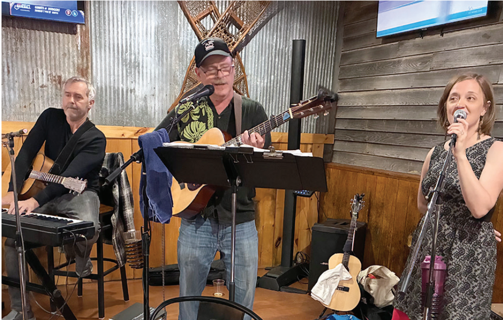
Sonic Love Child closes out the music fest.