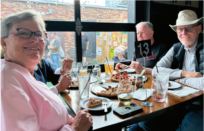
Fans of pizza and music at the Locker Room in Aitkin.