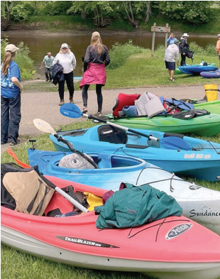
Paddlers at the Mississippi Landing in Aitkin.