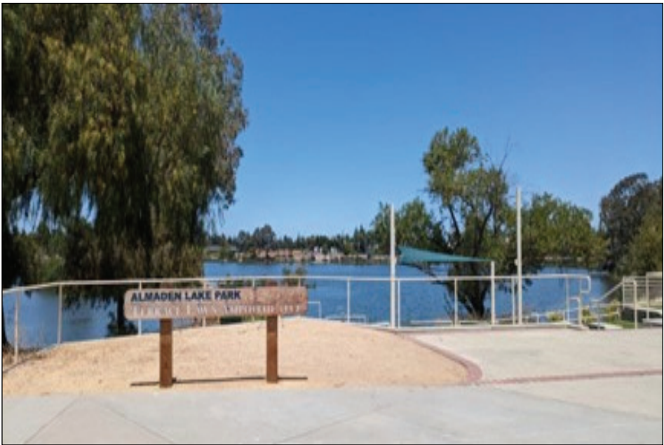
San Jose officials have canceled Independence Day festivities at Almaden Lake Park due to safety concerns.