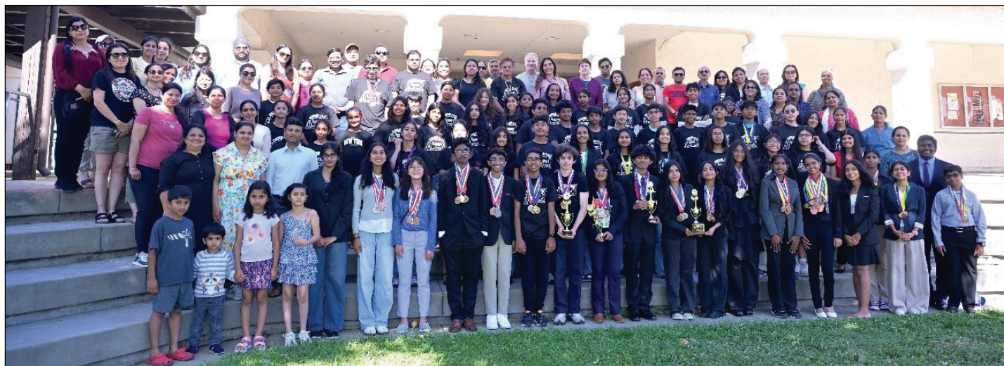
Chaboya Science Olympiad Community along with the Coaching Team, Chaboya Administration

for the many dedicated parents and volunteers who generously contributed their time and expertise mentoring students, writing tests, and proctoring events. These collective efforts were crucial to the season's success.