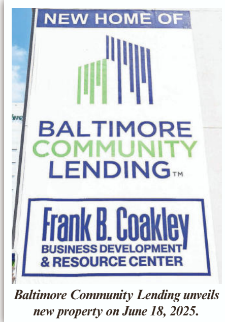
Baltimore Community Lending unveils new property on June 18, 2025.