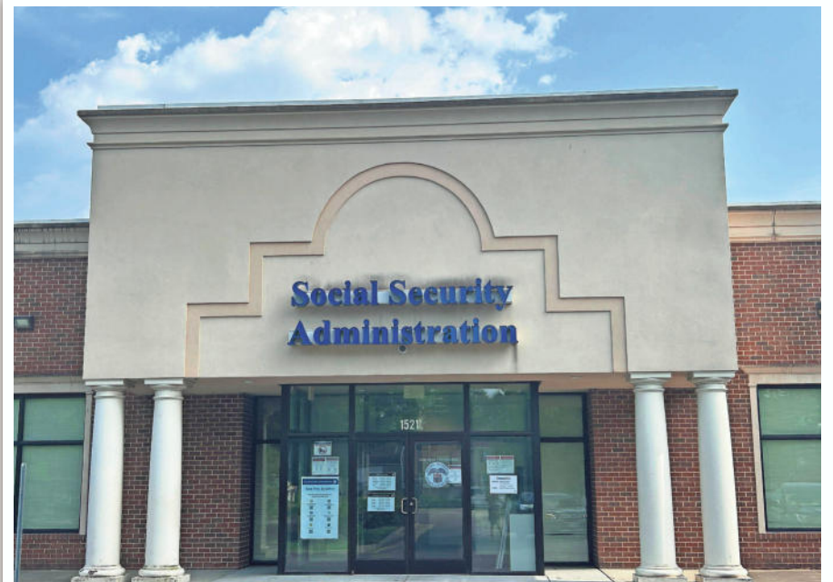
A new retirement age looms on the horizon for some future retirees who will seek full Social Security retirement benefits.

The Social Security Amendment of 1983 allowed for various changes including an retirement age increase for workers from the original age of 65 to 67 if they wanted to receive full benefit retirement, although gradual changes were set to be made over a period of time. Changes included a raised “age of eligibility for unreduced retirement benefits in two stages to 67 by the year 2027. Workers born in 1938 will be the first group affected