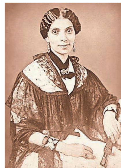
Mary S. Peake, American teacher and humanitarian

"Freed people, soldiers, and missionaries continued her mission. This site near the oak became the