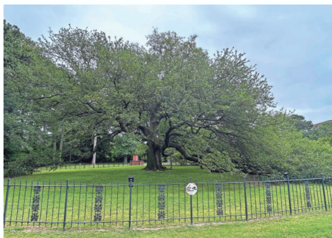
The Emancipation Oak is located at Hampton University.

Peake moved to Hampton with her family, where it was illegal for free Black people to meet for purposes of obtaining an education. She worked as a successful seamstress to support herself and was regarded as a member of the Black elite. Peake bravely held her first class on September 17, 1861