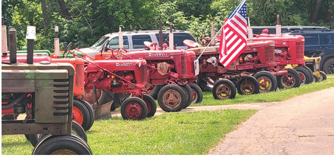
Restored, vintage tractors on display at the fairgrounds.

By ANN SCHWARTZ By now, the fair smells are a memory—hot grease, sugar, animals. The sounds of the fair—the carnival, children yelling, cows mooing, are