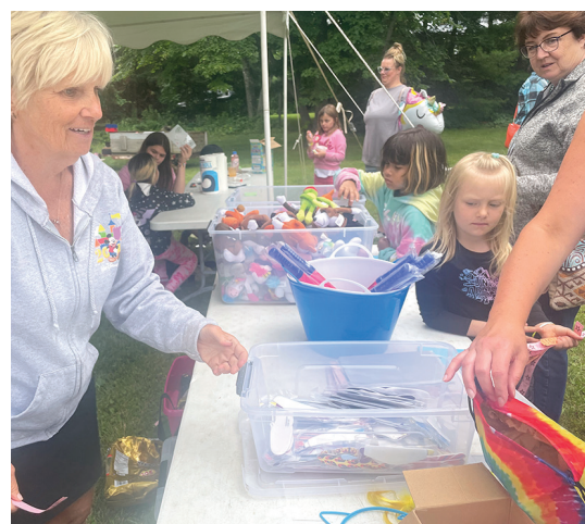
Sally of Turtle Lake sells tickets in the popular prize booth.