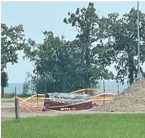
A pile of dirt remains after a basement was removed at the old Y Club in Garrison. MnDOT will use the site to construct a temporary roundabout for Hwys. 169/18.

"That is all we are doing this year," clarified Schiller. "We will spend the remainder of 2025 in final design planning for temporary and permanent roundabouts, some road resurfacing north