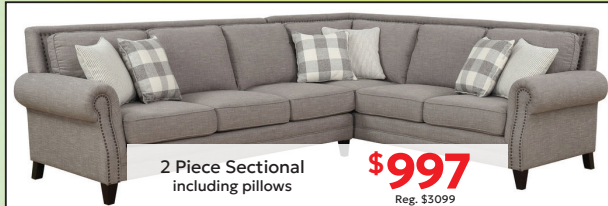
2 Piece Sectional including pillows