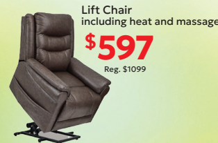
Lift Chair including heat and massage

5 Pc. Dining Room Set includes a table and 4 chairs and self-storing leaf $597 Reg. $1999