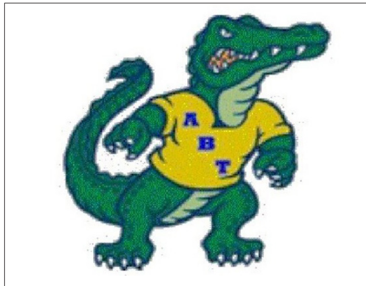
Melvindale Academy for Business &amp; Tech Gators — Logo