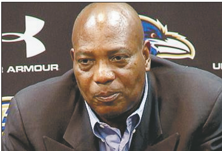
Baltimore Ravens general manager Ozzie Newsome speaking at the team's annual pre-draft press conference at the Under Armour Performance Center in Owings Mills, Maryland.

"At 36, there's a lot more volatility. There [are] a lot more different players you're going to be looking at—a lot more combinations. So, I've been spend-