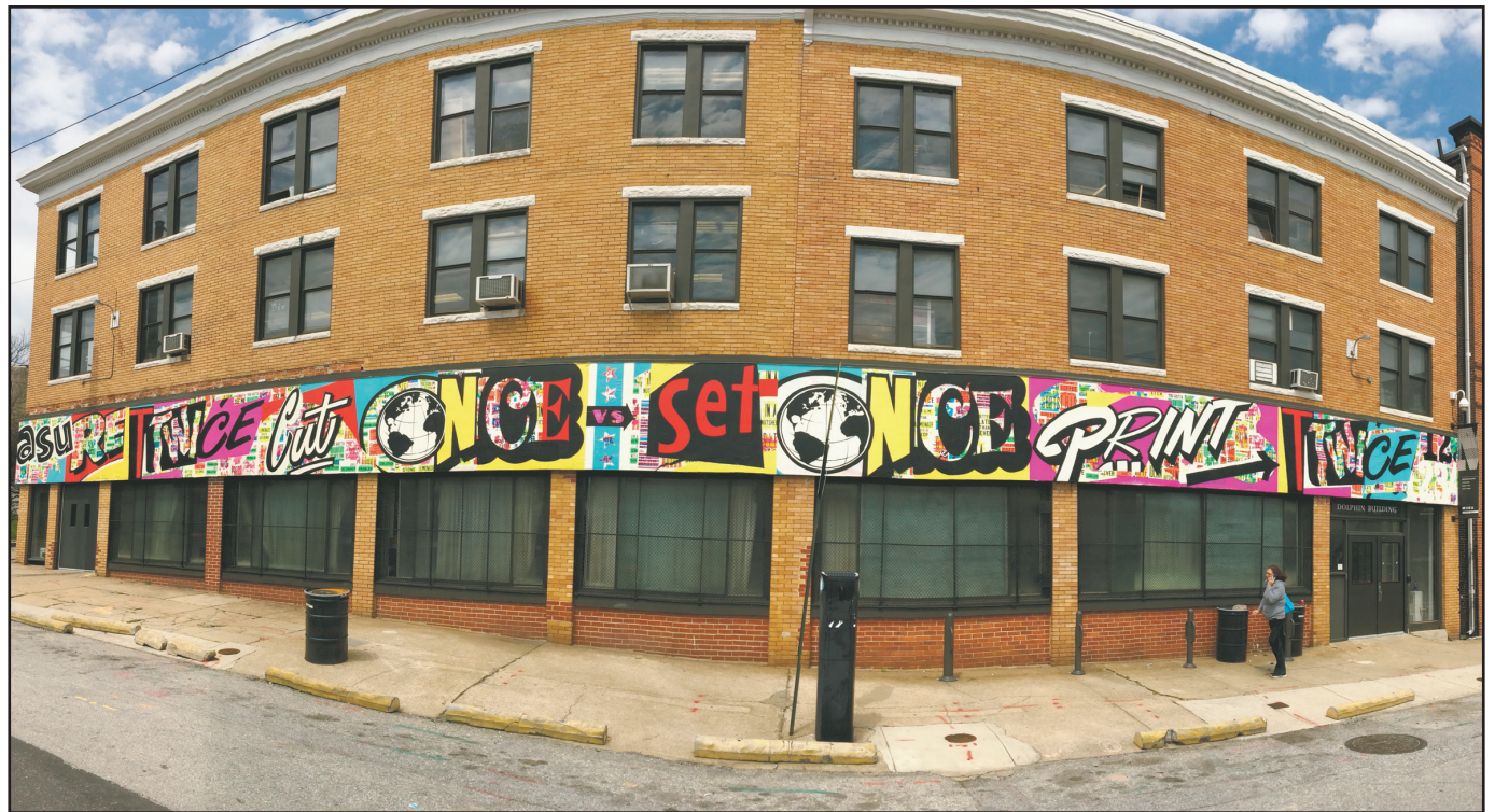
The vivid outdoor mural on the Dolphin Building located at 100 Dolphin Street in Baltimore is the result of the collaboration between MICA students in the school's Globe Poster Remix course and street artist Pose.

The pop-style street artist was an artist in residence at MICA from Tuesday, April 5 to Saturday, April 9, 2016, working with undergraduate students to further challenge and expand their skill sets. The Chicago based-artist POSE has worked with the historic Globe Collection and Press at MICA in 2014 on Hello Kitty Con, when they were tapped to design and print three limited edition posters celebrating the iconic character's 40th anniversary.