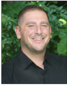
Comfort Advisor Boss Services

Next, replace your furnace's air filter. A clogged filter restricts airflow, forcing the system to work harder and increasing energy bills. Filters should be checked monthly and replaced every one to three months, depending on the type and household factors like pets or allergies. Standard fiberglass filters are affordable, costing $5 to $15, while high-efficiency pleated