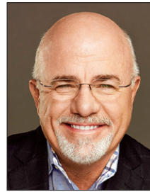
Financial Expert The Ramsey Show

By taking these steps—scheduling a check-up, replacing filters, cleaning the area, testing the system, ensuring safety, and optimizing with a thermostat—you'll ensure your furnace is winter-ready. Act now to avoid shivering through a cold snap or facing costly emergency repairs.