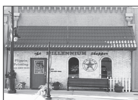
Flippin Printing located inside The Millennium Shopper at 115 Jefferson in Sulphur Springs.

The Tri-Immune Shot represents a forward-thinking approach to modern healthcare: one that emphasizes prevention, cellular health, and whole-body wellness. Rather than waiting for illness to strike, this blend empowers individuals to strengthen their natural defenses in a safe, effective, and evidence-based way. In a world where health is our greatest currency, the Tri-Immune Shot is more than a boost, it's an investment in vitality.