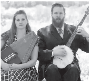
Roe Family Singers

The 2025 Fall Concert Season promises four exceptional Friday night performances at 7 p.m. at Journey Church,