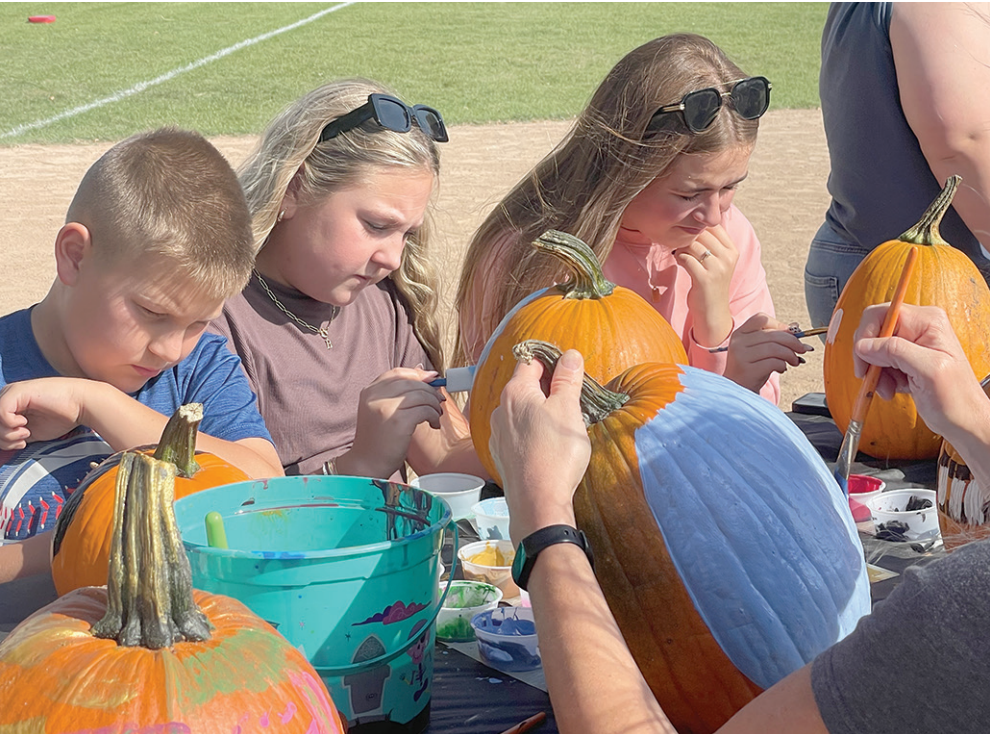
At the Great Pumpkin Fest in Memorial Park, Brainerd, families painted pumpkins and played games on Oct. 3.