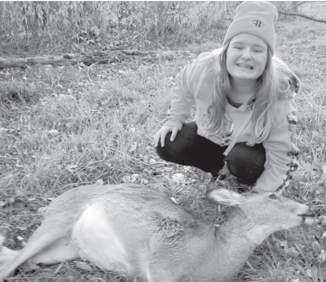
Persistence and patience paid off ending with a perfect shot for this young lady. It was her first deer on last day of youth season. And she is all smiles, as she wanted venison jerky.

As the fall colors peak and temperatures cool just enough to feel like autumn, Minnesota hunters are gearing up for one of the most exciting weekends of the year. From Thursday, Oct. 16, through Sunday, Oct. 19, the woods will once again welcome young hunters and seasoned deer chasers alike for the Statewide Youth Deer Season and Early Antlerless-Only Deer Season. Youth deer season For young Minnesotans