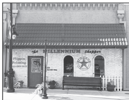
Flippin Printing located inside The Millennium Shopper at 115 Jefferson in Sulphur Springs.