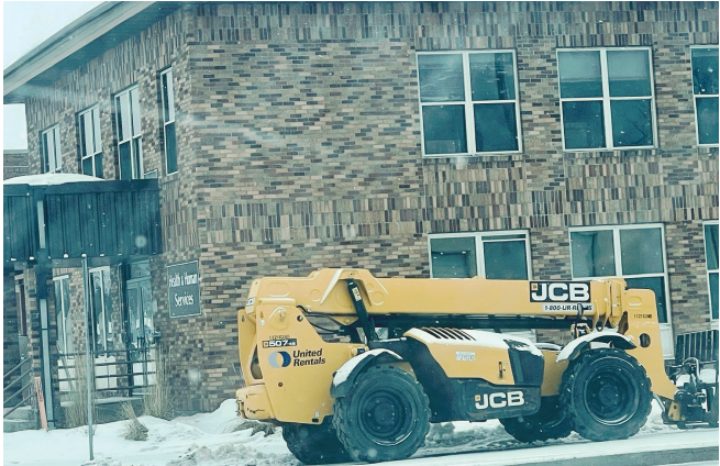
Construction is busy at the southeast corner of the courthouse block in Aitkin.