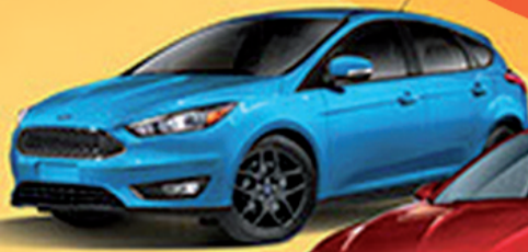
FORD FOCUS 3 In Stock