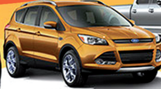
FORD ESCAPE 28 In Stock