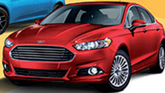
FORD FUSION 10 In Stock