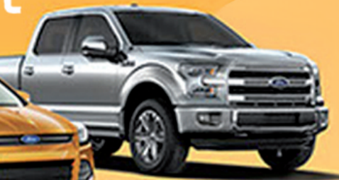
FORD F-150 27 In Stock