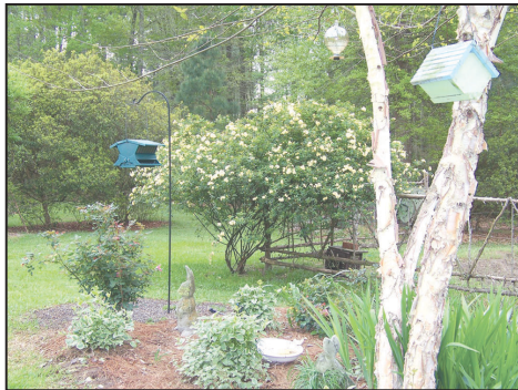
The Lady Banks "rose" has been gorgeous this year.

I've been a maniac with the loppers this week. I'm trying to train a yaupon, cut the bottom branches off that sucker. We saw a yaupon "tree" at the Dallas Arboretum; it was very attractive. My day lilies have gone mad; they are thick as thieves . . . wonder if it's too late to thin them out?