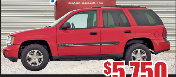
02 Chevy Trailblazer SL