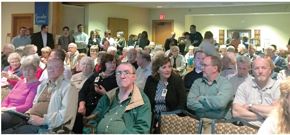
A large crowd of over 120 people wanted to hear about the future of public community hospital, Cuyuna Regional Medical Center in Crosby on April 20.