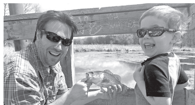
a super sports license includes a trout/salmon stamp, small game with pheasant and waterfowl, and a deer tag (archery, firearms or muzzleloader).

51 and older. These can be gifts – for you or to somebody else. Youth ages 16 and 17 can buy an annual license for $5. Kids 15 and under are not required to buy a license to fish, but must comply with fishing regulations. For those who hunt and fish, a sports license includes angling and small game, and