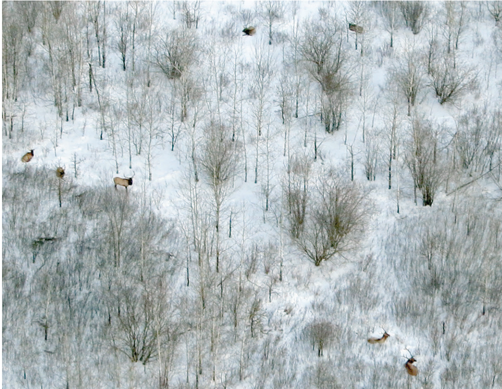
Aerial view of seven elk bulls.

Fluctuations in the 2016 annual elk population survey illustrate one of the primary reasons wildlife researchers have begun placing GPS collars on elk in northwestern Minnesota and tracking their movements.