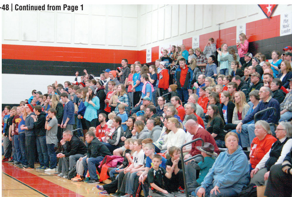
The crowd filled the Aitkin gym with the student section at the left

Fighting hard for every rebound, the Gobblers ex-