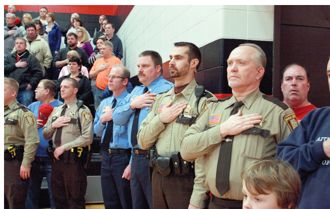
Officers and firefighters line up for the National Anthem.