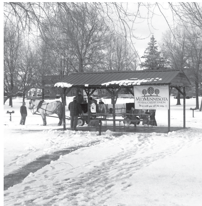
Dashing through a little snow in a one-horse open wagon was part of Christmas in the Park in Crosby on December 2.