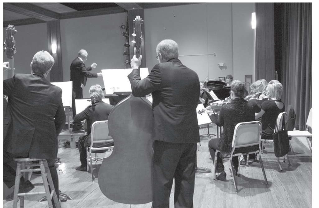
Great River Strings completed its fall concerts in Crosby and Aitkin in November that portrayed a message about peace in the world. The concerts' message was timely with the recent world upheaval and terrorist attacks. Watch for the spring concerts in Crosby and Aitkin in April 2016.