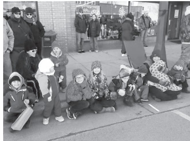
Children lined the parade route, happy to have a holiday.