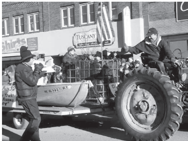
The Aitkin Cub Scout Pack 52 float.