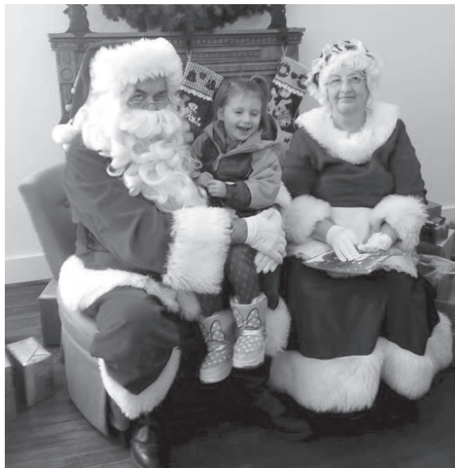
It was sunny and bright for the Fish House Parade in Aitkin this year on. A whole day of activities included Santa and Mrs. Claus presiding at the Beanery.