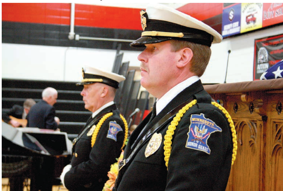
Honor guard at the funeral. Behind them is the altar with a flag and the deputy's remains.