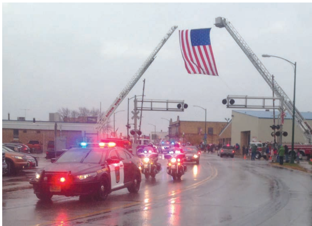
Fire truck ladders and a huge flag over Minnesota Avenue made a ceremonial arch for squad cars to pass under.

turned tail if she knew what she was in for. Thinking she was coming to a sleepy small town, she was faced with conducting the service for