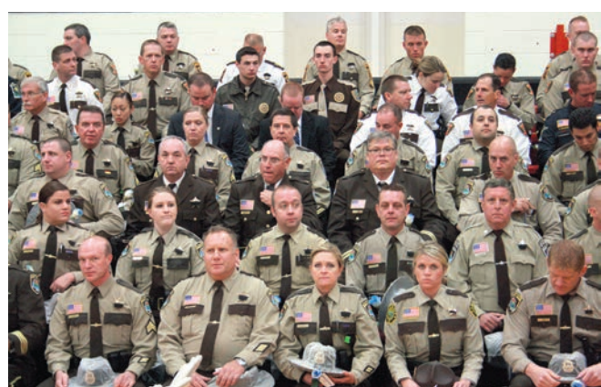
Deputies from all around Minnesota at the funeral.