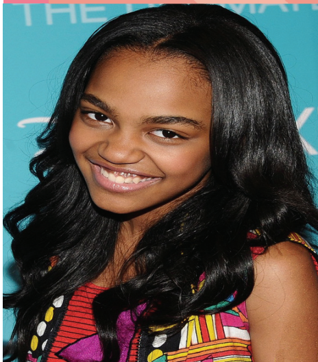
China Anne McClain Actress, Singer & Songwriter