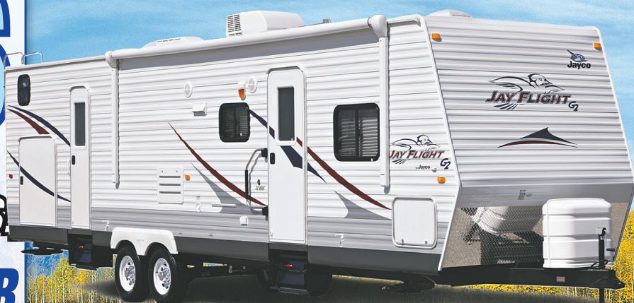
Home of the #1 selling travel trailer in the world. Jayco Jay Flight - Comes Standard with 2 years warranty.

MANY OF THE 2017 FLOORPLANS ARE NOW IN... SPECIAL SHOW PRICES WILL BE THE LOWEST OF THE YEAR!