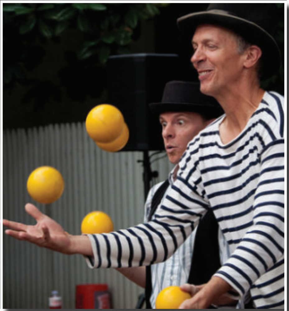
The Give and Take Jugglers will perform at this year's June Fete Fair.

ing public relations. Each auxiliary is unique in its size, demographic, meeting schedule, menu of activities and fundraising events. Each one has its own special charm. What can you expect from your experience as a volunteer? You will have the opportunity to help others and contribute to our community, apply your talents in a new setting, forge new friendships, support a great cause and, more than anything else, be part of something so much bigger than oneself. "There are no strangers here, only friends you haven't met." — William Butler Yeats Visit our website at http://give.abingtonhealth.org and find an auxiliary you can call home. Don't delay ... new members are always welcome, and there's no time like the present to put yourself out there and make a difference in the lives of others.