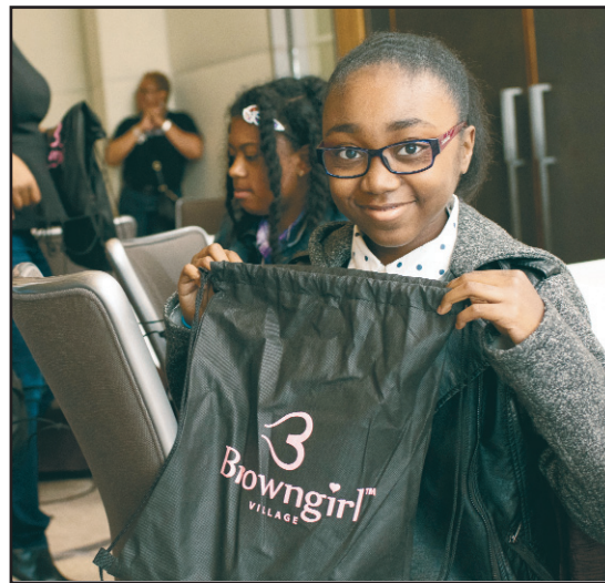
A Brown Girl shows off her book bag.J