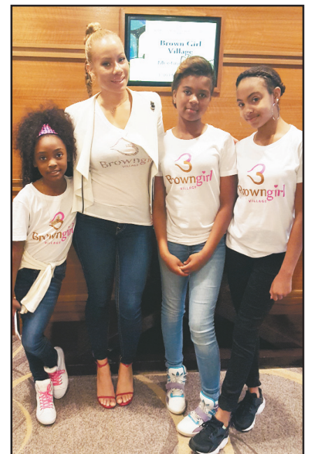
Brave poses with Brown Girls.

“Brown Girl Village will help our young women to realize that anything is possible with hard work, dedication and determination and open their eyes to new possibilities.”