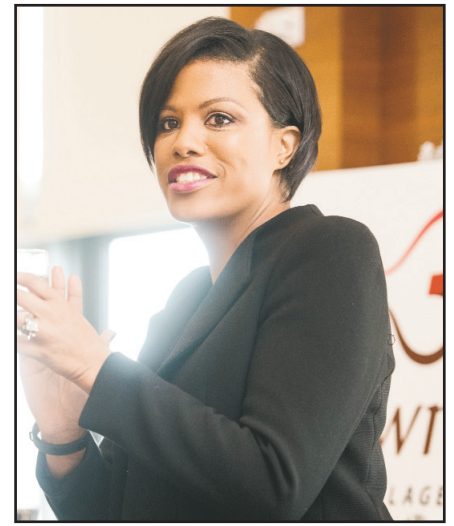
Mayor Stephanie Rawlings-Blake