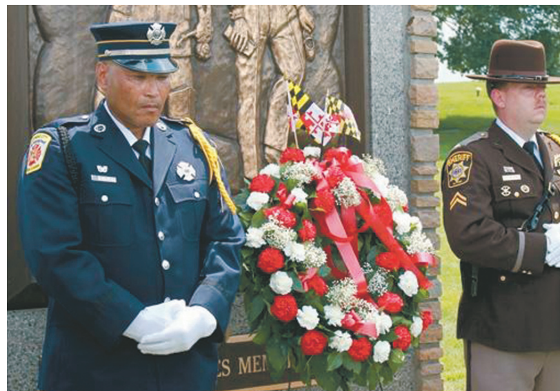
Monument at the Circle of the Immortals