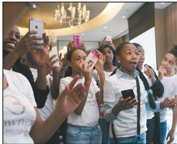
Surprise! It's China