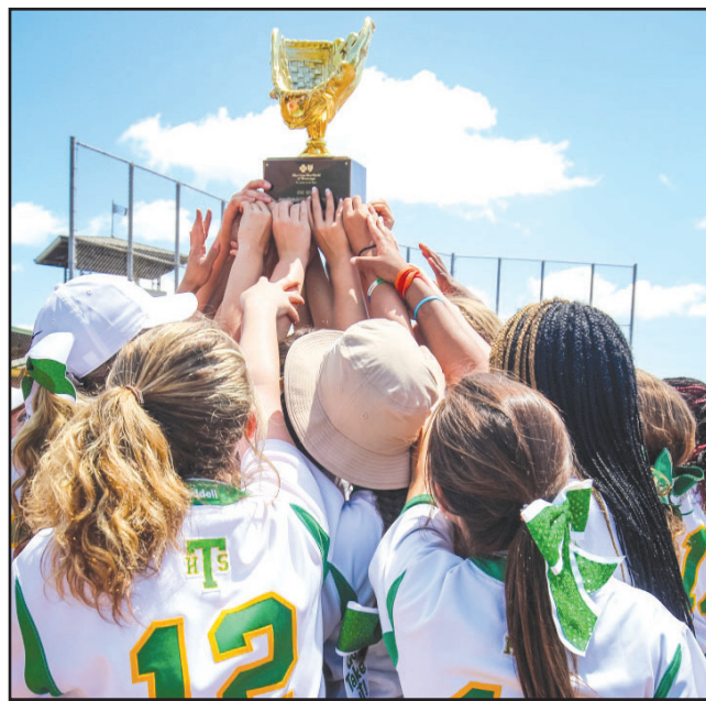
The Lady Tartars hold up the championship trophy after sweeping East Webster.