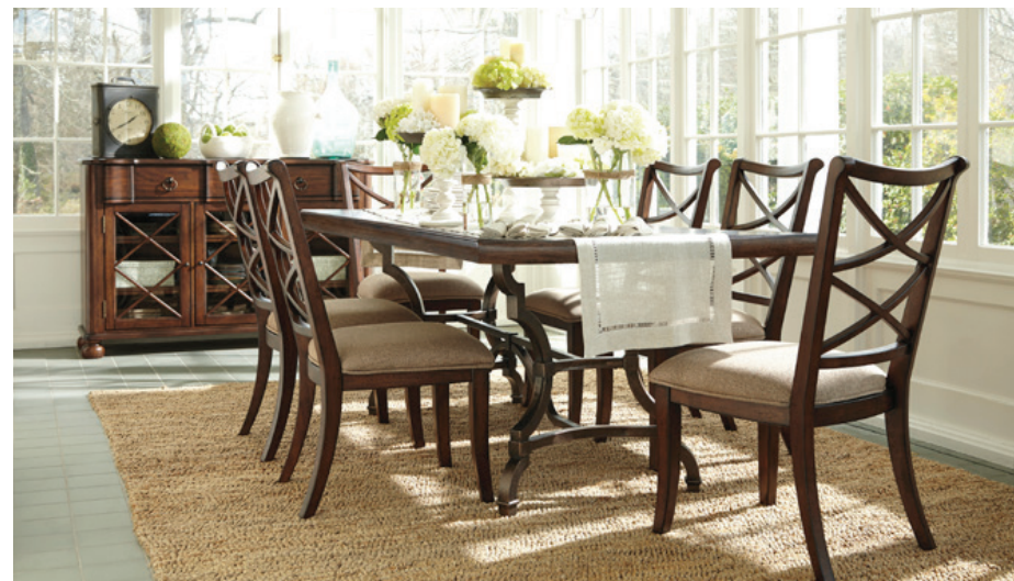
now only Hyland 5-Piece Dining Room $899

or 6 YEARS no interest* On purchases of $2000 or more with your Ashley Advantage™ credit card made between 05/10/16 - 05/30/16. Equal monthly payments required for 72 months. See store for details.