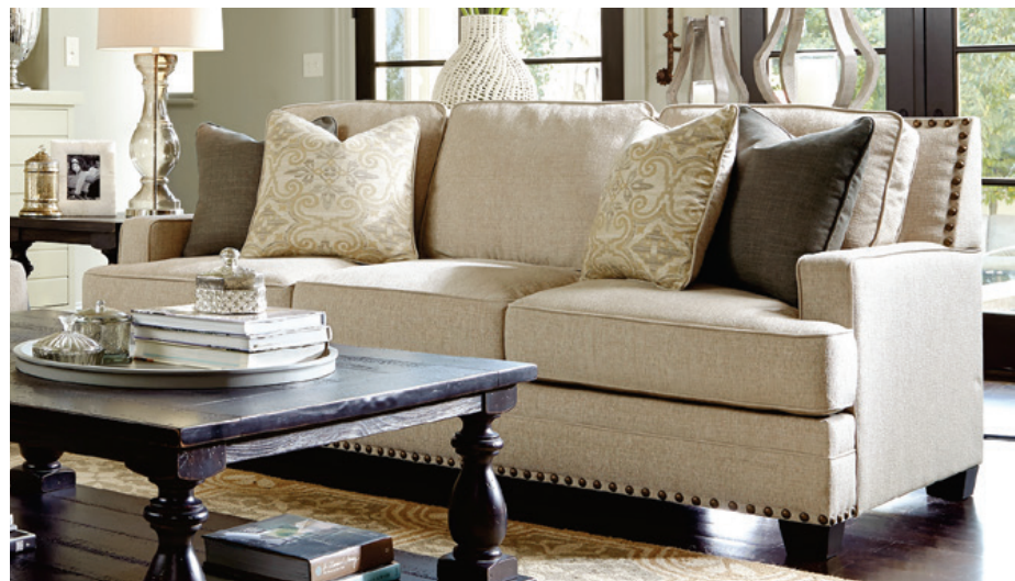
now only Cloverfield Sofa $699

6143 US HWY 98 (TURTLE CREEK CROSSING) HATTIESBURG, MS 39402 601-602-0200