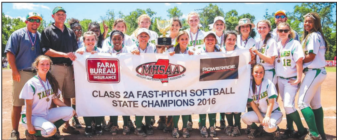
The 2016 Taylorsville Lady Tartars