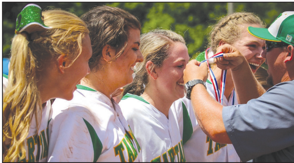
The Lady Tartars receive their individual medallions for capturing the 2A state championship.