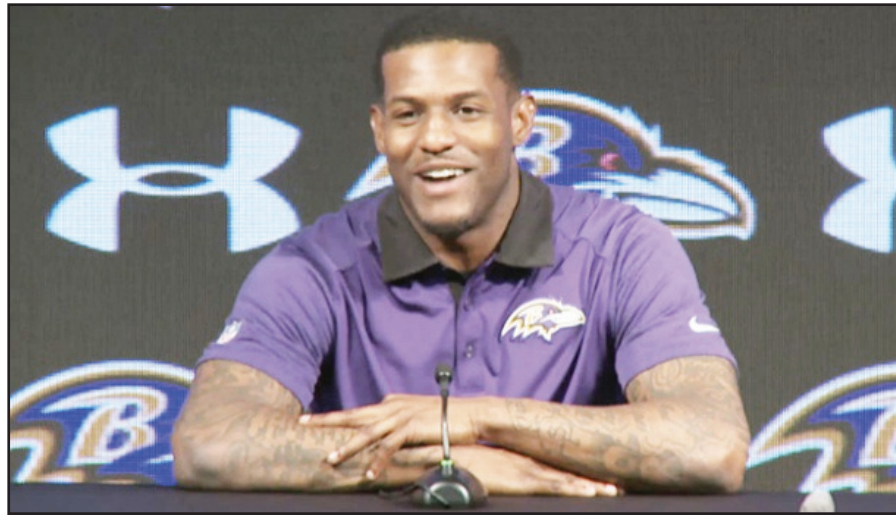
Ravens wide receiver Mike Wallace reacts to a question during his introductory press conference at the Under Armour Performance Center in Owings Mills, Maryland.

calling to do it here— more of an aggressive play-calling style," Wallace said. "That's why I chose to come here, because I felt like it gave me the best opportunity to make big plays, like I want to do."