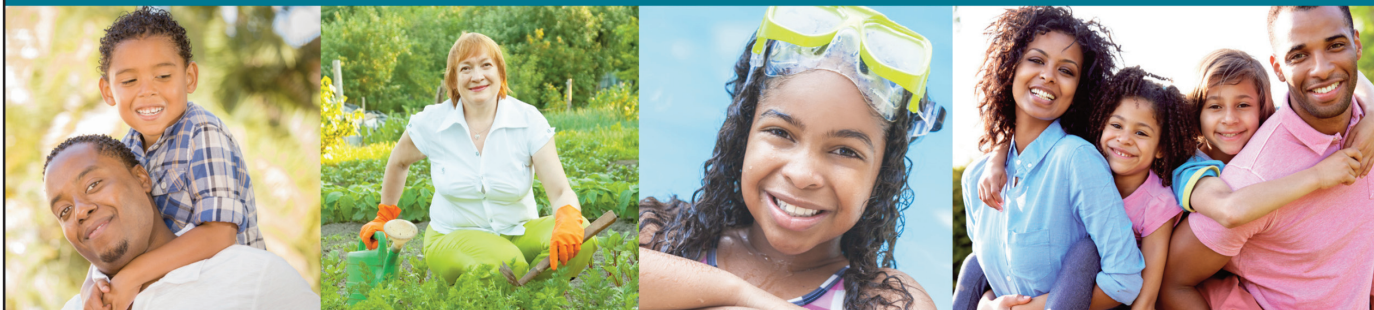
Positive stories about positive people!