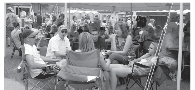
Relaxing with friends and family makes summer great.