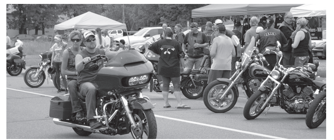
Crowds gather by the Woodtick Inn in downtown Cuyuna.