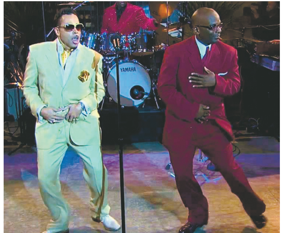
Morris Day and Jerome Benton of The Time

The concert is scheduled to begin at 9 p.m.. For more information, visit http://menwomenofrespect.com/oureven/ts/morris-day-the-time/