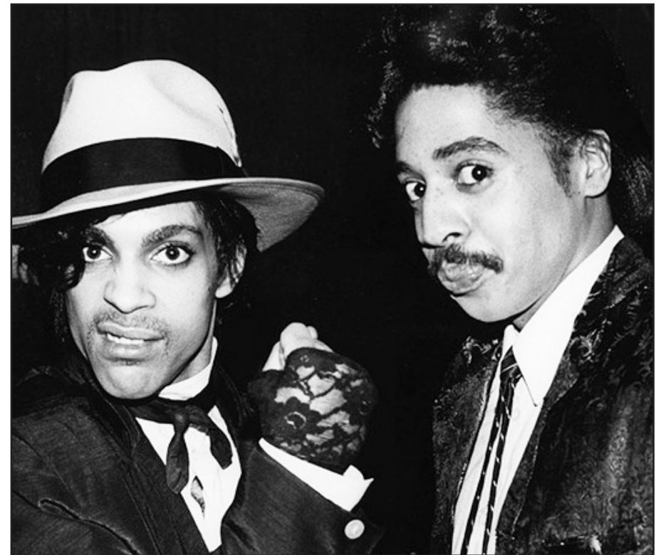
Morris Day and Prince