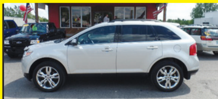
2012 EDGE LIMITED AWD. Stk. #7482 $17,995