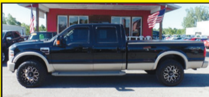
2008 FORD F250 King Ranch, diesel. Stk. #7208A $27,995