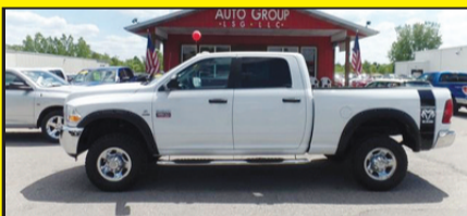
2010 RAM 3500 Diesel SLT. Stk. #7505 $30,995