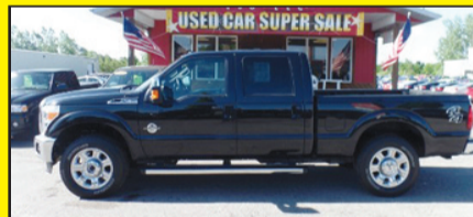
2015 FORD F250 LARIAT Diesel. Stk. #7401 $52,995