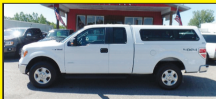
2013 FORD F150 Ecoboost. Stk. #7465 $21,995