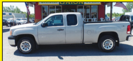
2008 GMC SIERRA 4x4. Stk. #7441 $16,495