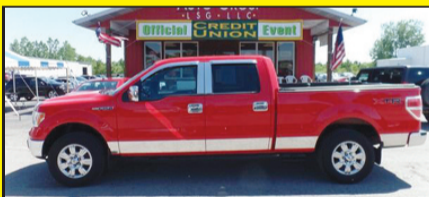
2011 FORD F150 SUPERCREW Stk. #7412 $20,995