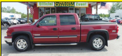
2006 CHEVY SILVERADO 4x4. Stk. #7429 $16,995