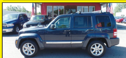
2008 LIBERTY LIMITED 4x4. Stk. #7495 $12,995