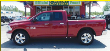
2015 RAM 1500 4x4. Stk. #7445 $29,995