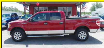
2014 F150 XLT 4x4. Stk. #7490 $26,995