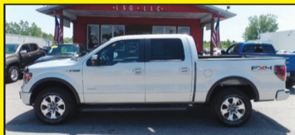
2011 FORD SUPERCREW FX4 Loaded, 53,000 mi. Stk. #7431 $27,995