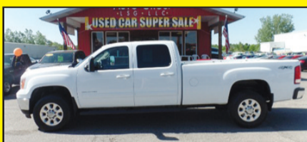
2014 GMC 3500 4x4. Stk. #7400 $41,995