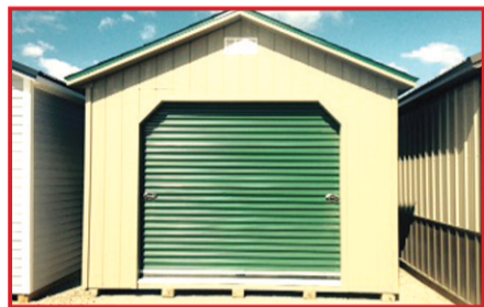
12x20 4' Loft, $3,458