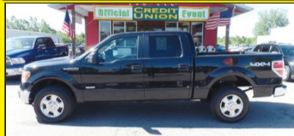
2013 FORD F150 4x4. Stk. #7437 $25,995