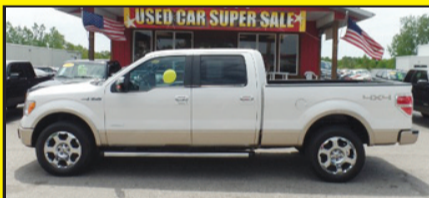
2012 FORD F150 SUPERCREW LARIAT Loaded. Stk. #7406 $24,995