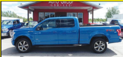
2015 F150 XLT 13k miles Stk. #7509 $37,995