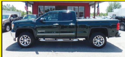
2014 GMC SIERRA SLT 21,000 mi. Stk. #7456A $35,995