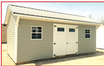
10x20 Quaker, $3,610

Free Delivery w/ in 70 miles • Statewide Delivery Available