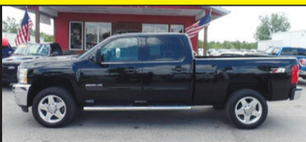
2013 SILVERADO LTZ Duramax, Stk. #7503 $48,995