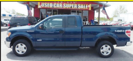
2013 FORD F150 4x4. Stk. #7364 $20,995

LIFETIME ENGINE WARRANTY • LIFETIME ENGINE WARRANTY • LIFETIME ENGINE WARRANTY • LIFETIME ENGINE WARRANTY