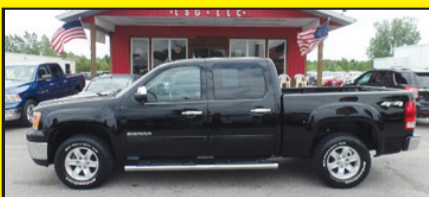
2012 SIERRA SLE 4x4. Stk. #7508 $26,995