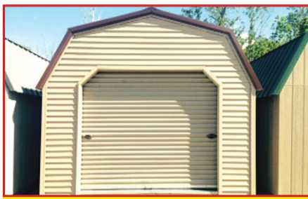
12x24 Side Entry Door, 3 Windows, 8' Loft, $4,729