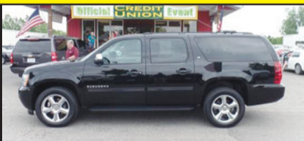
2013 CHEVY SUBURBAN Loaded. Stk. #7469 $33,995