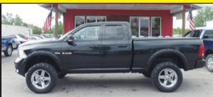
2009 RAM SLT 4x4. Stk. #7460 $20,995