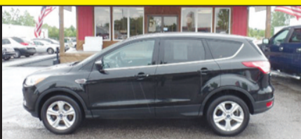
2013 ESCAPE 4x4, SE. Stk. #7462 $16,995