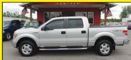
2010 F150 XLT Loaded. Stk. #7497 $18,995