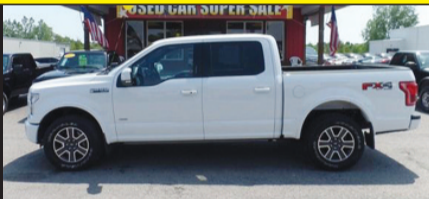
2015 FORD F150 LARIAT 4x4. Stk. #7424 $45,995