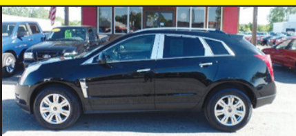
2010 CADILLAC SRX AWD. Stk. #7493 $17,995