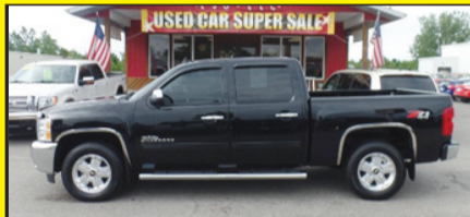
2013 CHEVY SILVERADO 4x4. Stk. #7425 $24,995