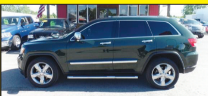
2011 GRAND CHEROKEE LIMITED Stk. #7496 $22,995