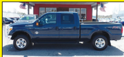
2015 FORD F250 4x4, diesel. Stk. #7317 $39,995