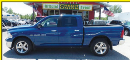
2011 RAM 1500 4x4. Stk. #7439 $21,995