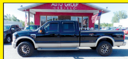
2008 FORD F-250 SD XLT 4WD. Stk. #7208A $27,995