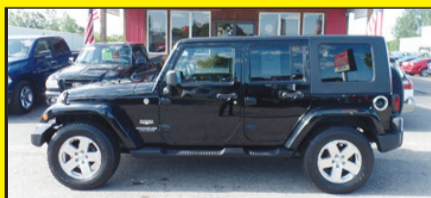
2008 WRANGLER 4x4. Stk. #7489 $20,995