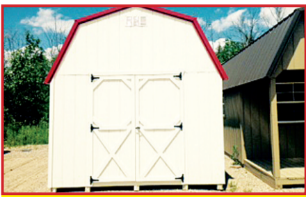
10x12 1 window 6' loft, $2,035

DON'T WASTE YOUR SUMMER VACATION TRYING TO BUILD YOUR OWN STORAGE BUILDING. COME SEE US, WE WILL BUILD IT FOR YOU!!