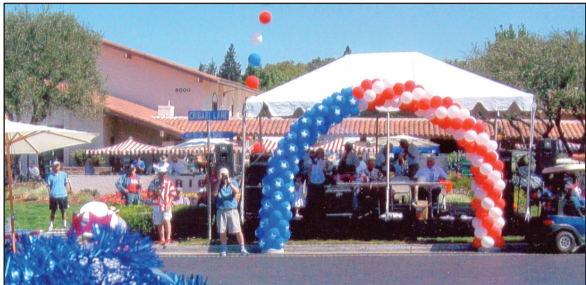
Parade review stand at Cribari Center: Judges rate the entries as they pass by.