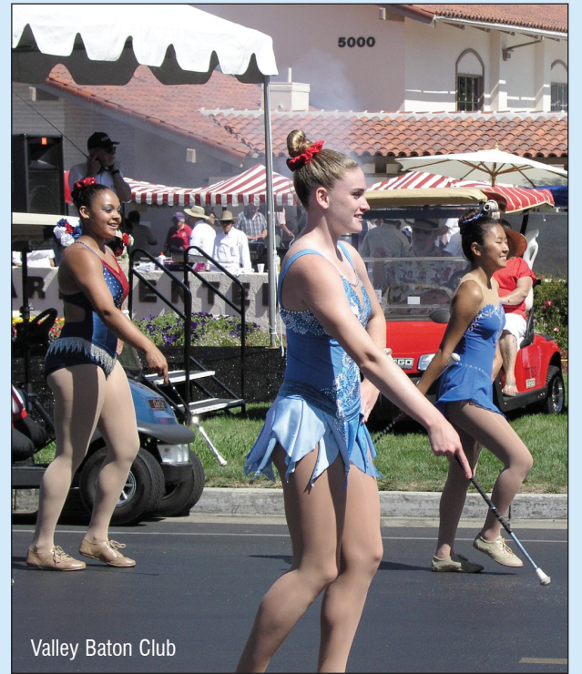
Valley Baton Club