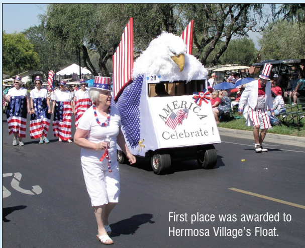
First place was awarded to Hermosa Village's Float.