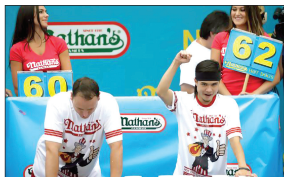
Matt Stonie of Evergreen Valley (R) celebrates after defeating long time defending champion Joey Chestnut (L) at Nathan's Famous Fourth of July International Hot-dog eating contest in Coney Island.

Stonie, who lives in Evergreen Valley said he is looking forward to a rematch with Chestnut next year. "Obviously I hope that See HOT DOG, page 3