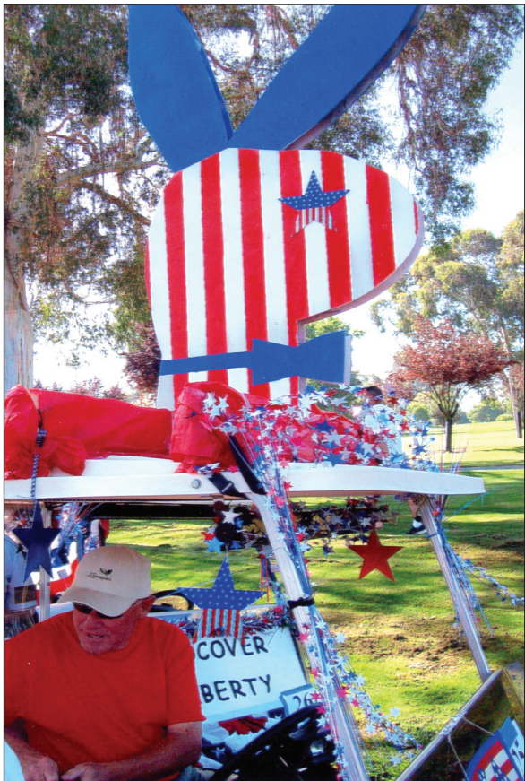
Villages Democratic Club's golf cart: Stars and stripes give the Democratic Donkey entry a Fourth of July look.