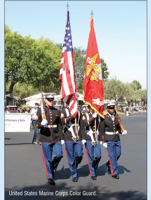
United States Marine Corps Color Guard.