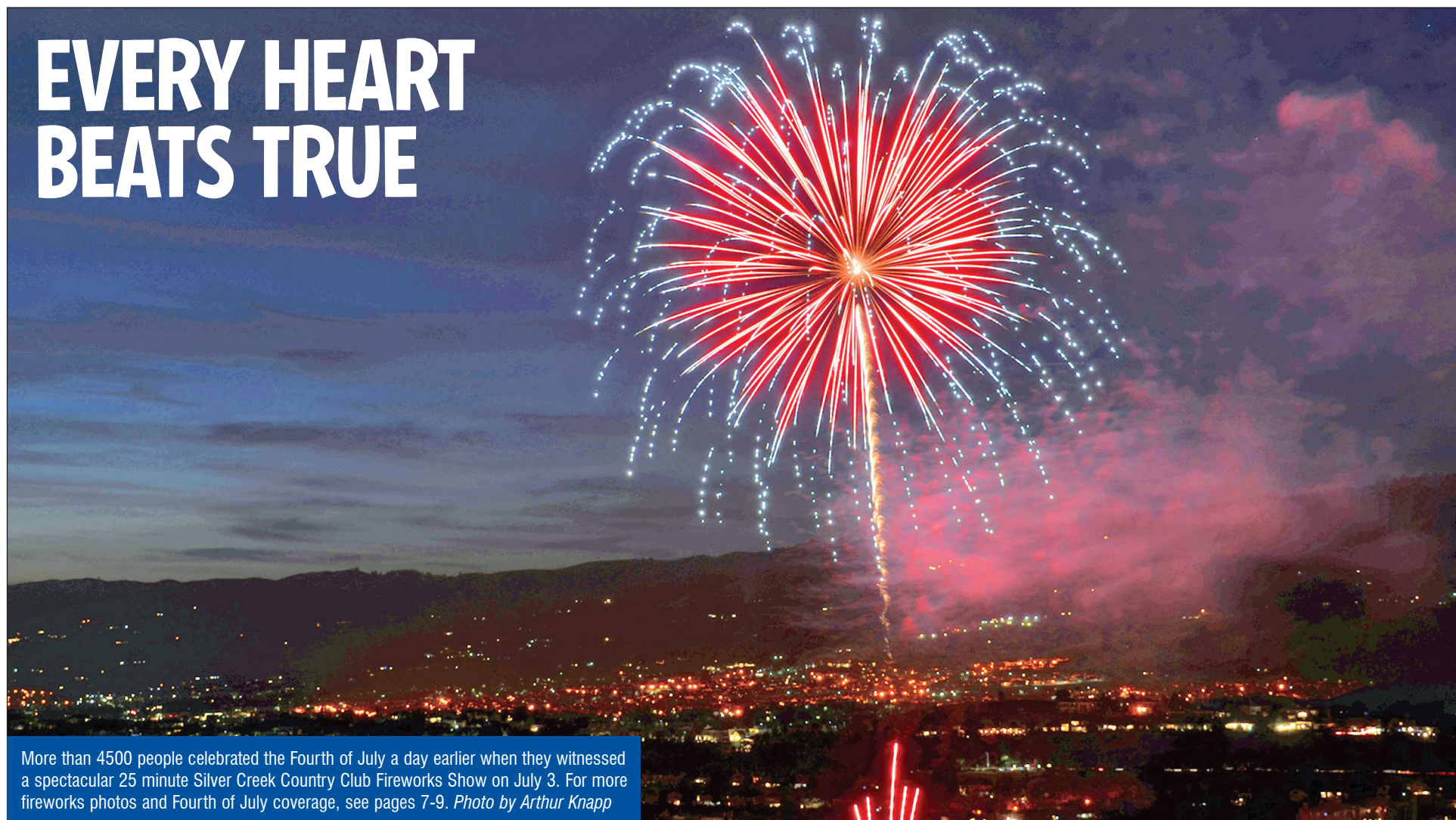
More than 4500 people celebrated the Fourth of July a day earlier when they witnessed a spectacular 25 minute Silver Creek Country Club Fireworks Show on July 3. For more fireworks photos and Fourth of July coverage, see pages 7-9.

SERVING EVERGREEN & SILVER CREEK VALLEY ■ EVERGREENTIMES.COM