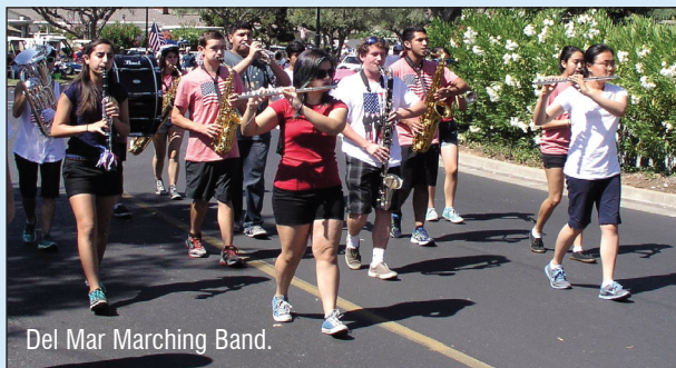
Del Mar Marching Band.