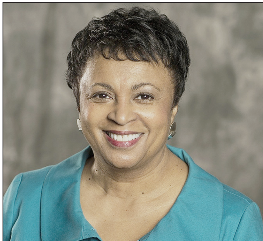
Dr. Carla Hayden

Dr. Hayden first served as a children’s librarian in the Chicago Public Library system, eventually rising to the post of deputy commissioner and chief librarian in that system. She also taught Library and Information Science at the University of Pittsburgh. She received Library Jour-