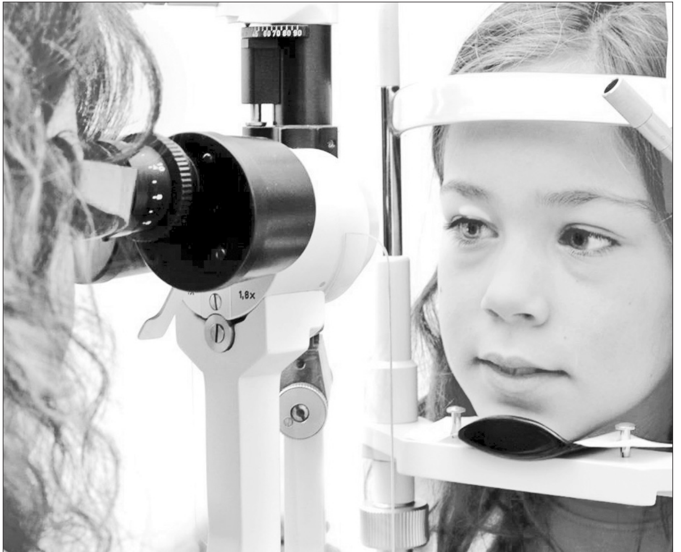
An eye exam can find and correct vision problems that may interfere with a child's ability to learn.