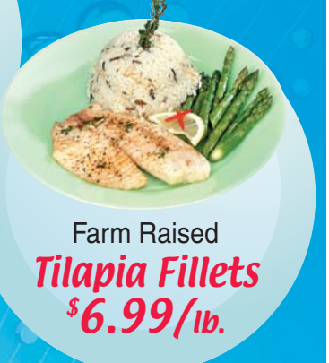
Farm Raised Tilapia Fillets $6.99/lb.