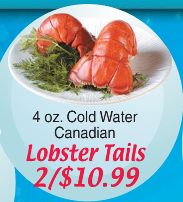
4 oz. Cold Water Canadian Lobster Tails 2/$10.99