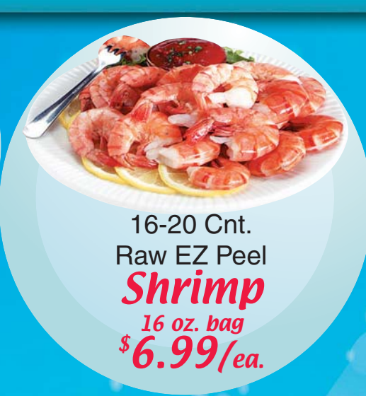
16-20 Cnt. Raw EZ Peel Shrimp 16 oz. bag $6.99/ea.