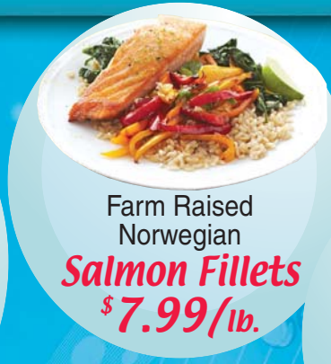
Farm Raised Norwegian Salmon Fillets $7.99/lb.