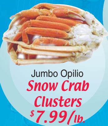
Jumbo Opilio Snow Crab Clusters $7.99/lb.

Fri., Sat., & Sun., Sept. 5 th , 6 th & 7 th • 9 a.m. - 6 p.m. *** Walworth Location Only ***