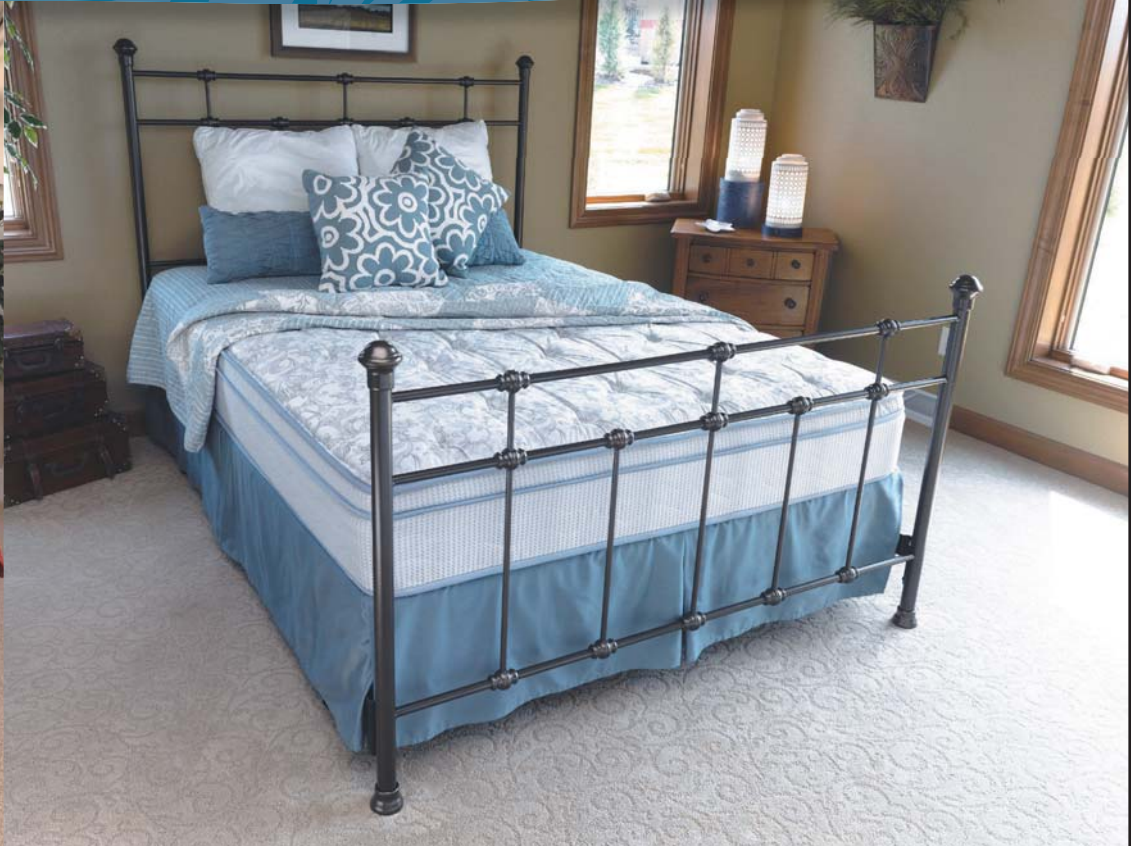
* see store for details