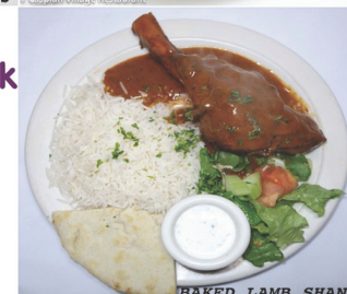
BAKED LAMB SHANK

Kebobs Baked Lamb Shank Sicilian Lasagna Moussaka Butter Chicken Gyros & Falafel & Many More