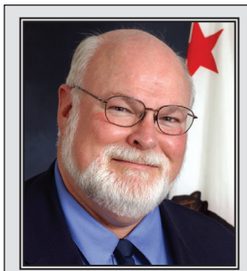
State Senate Report Jim Beall District 15

Senator Jim Beall represents California State Senate District 15, which is composed of the cities of San Jose, Cupertino, Campbell, Monte Sereno, Saratoga, and Los Gatos.