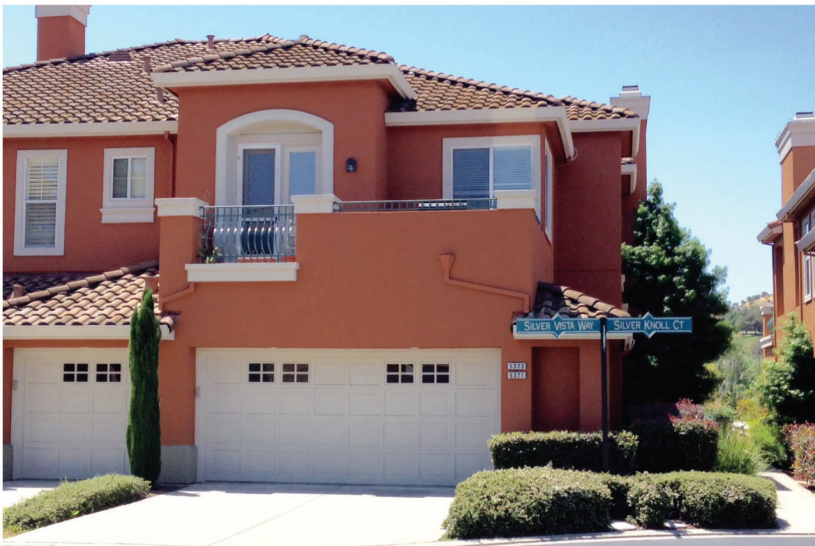
SILVER CREEK COUNTRY CLUB $948,000