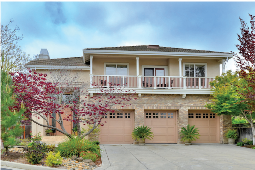
SILVER CREEK COUNTRY CLUB $1,695,000