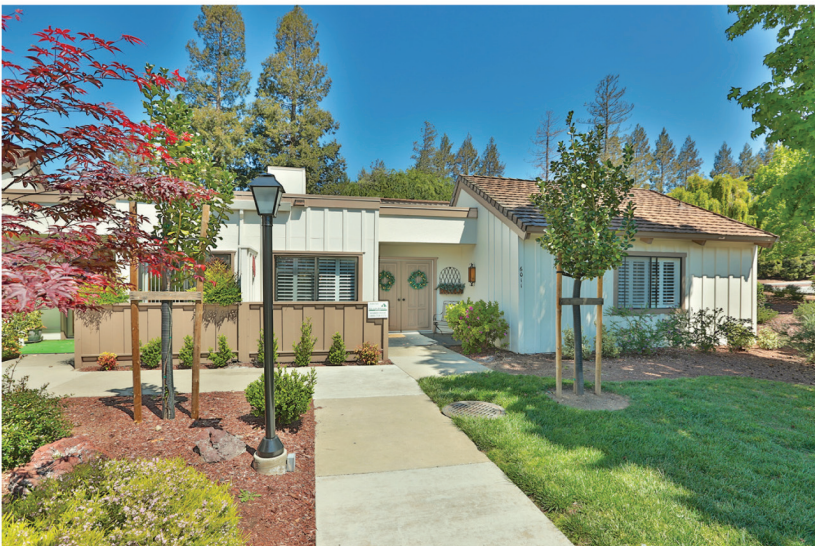
THE VILLAGES $625,000

5373 Silver Vista | 2bd/2ba Kerry Sexton | 408.754.1500