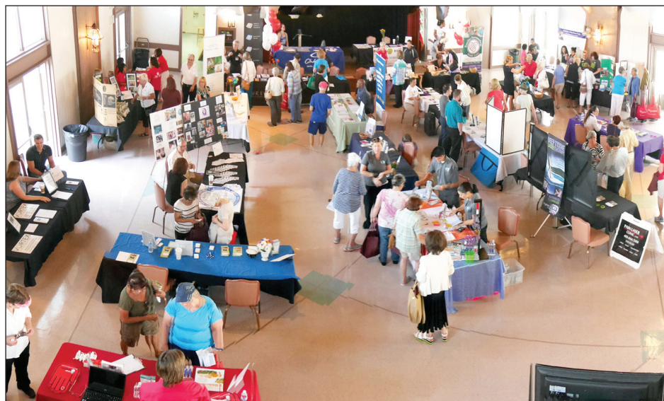
The Villages' Cribari auditorium and most of the meeting rooms had numerous displays.