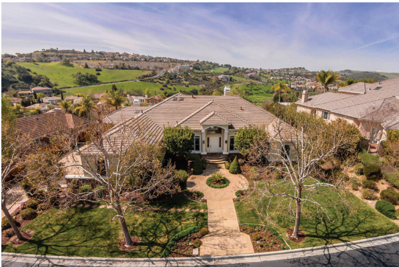
SILVER CREEK COUNTRY CLUB $2,499,000