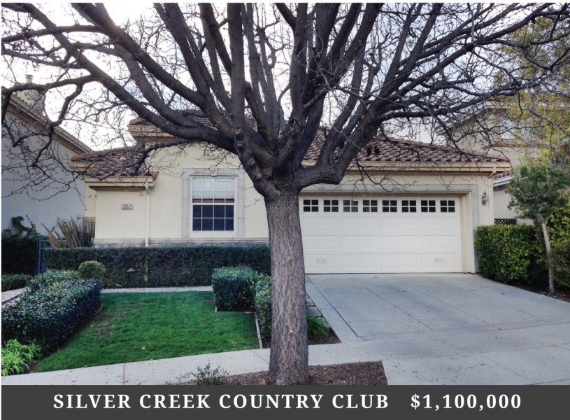
SILVER CREEK COUNTRY CLUB $1,100,000

6421 Rolling Meadow | 5bd/3ba Kerry Sexton | 408.754.1500