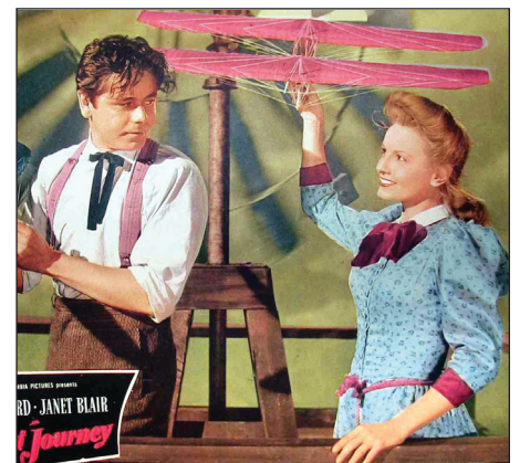
The 1946 film Gallant Journey stars Glenn Ford as California aviation pioneer John J. Montgomery and Janet Blair as his wife, Regina.

SEE OUR LISTINGS OF EVERGREEN AREA MEETINGS, PLACES OF WORSHIP AND CLASSIFIED ADVERTISEMENTS INSIDE THE BACK COVER