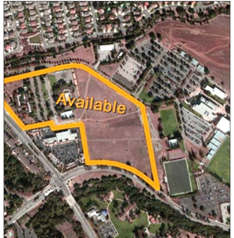
A map of the planned development at Evergreen Valley College.

Sealed bids to develop the surplus land are to be delivered to the college no later than April 14, 2015. The district could then enter into negotiations with a developer on the actual lease.