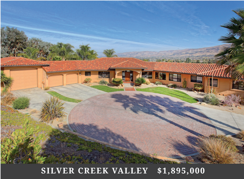
SILVER CREEK VALLEY $1,895,000