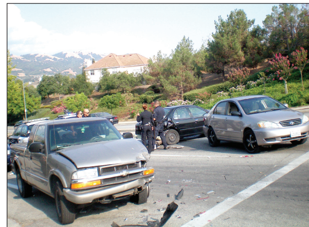
The scene pictured is becoming very familiar on Yerba Buena Road in Evergreen.

Automobiles have been observed coming down from the college on Yerba Buena Road at excessive speeds, not taking into consideration the myriad of traffic at that time. As soon