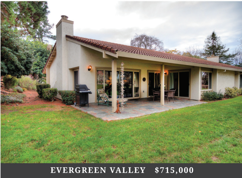
EVERGREEN VALLEY $715,000

5857 Killarney Circle | 3bd/2ba Kerry Sexton | 408.754.1500