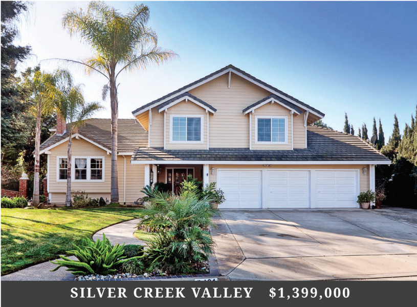
SILVER CREEK VALLEY $1,399,000