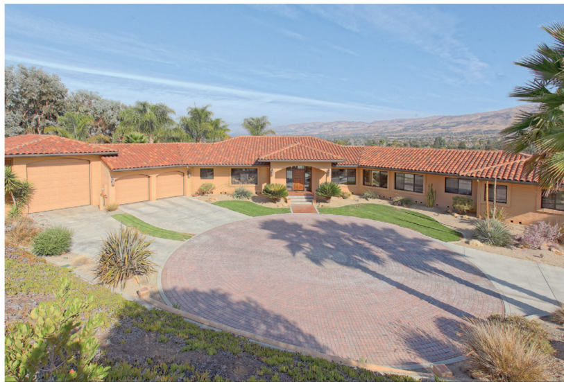
EVERGREEN VALLEY $1,895,000

5866 Country Club Pkwy | 4bd/4.5ba E. Parker/N. Brown | 408.754.1500