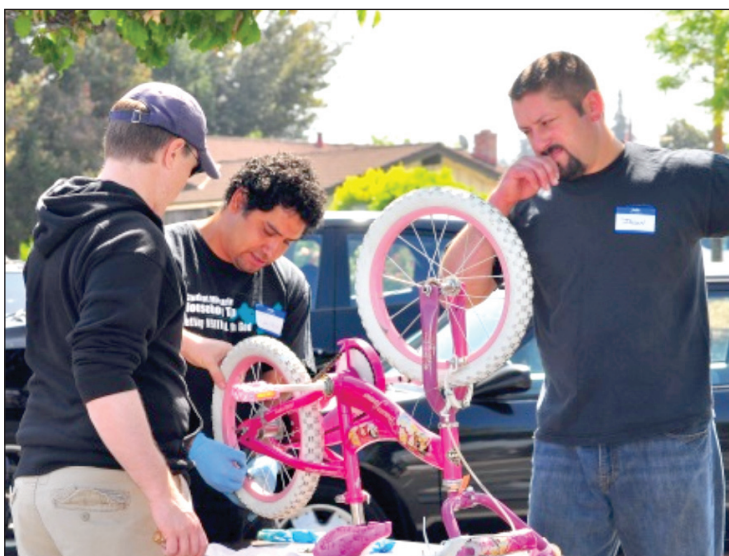
Devoted "bike medics" will repair flat tires, lubricate sprocket chains and pedals, adjust brakes and gears, and perform safety checks.