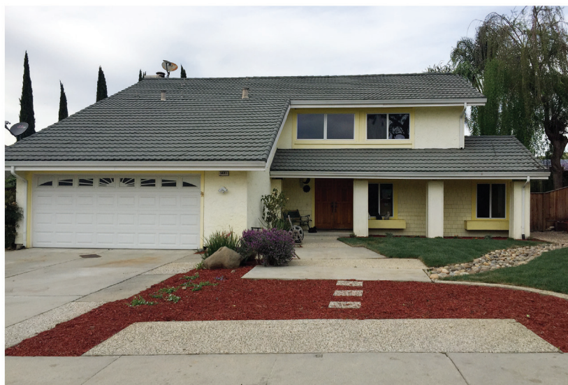
EVERGREEN VALLEY $799,000

2858 Sweetleaf Court | 4bd/2.5ba S. Gutierrez/I. Estrada | 408.754.1500