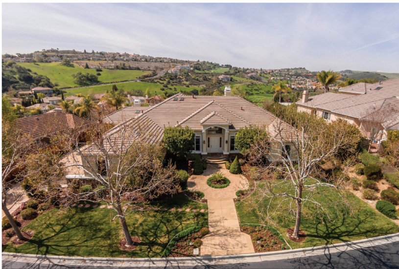
SILVER CREEK COUNTRY CLUB $2,599,000

5866 Country Club Pkwy | 4bd/4.5ba E. Parker/N. Brown | 408.754.1500