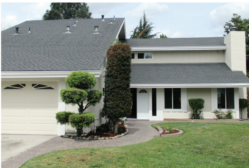
EVERGREEN VALLEY $949,000