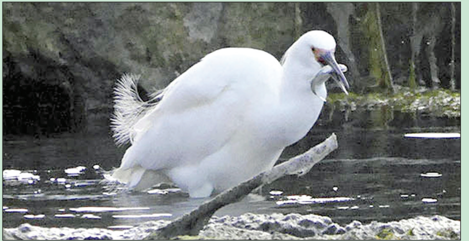
A great white egret waded into a pool at the waterfall between the 6th and 7th fairway at the Villages Golf and Country Club golf course to catch a fish for breakfast on April 4.