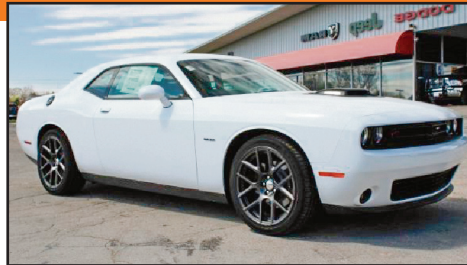
2016 Dodge Challenger R/T

Was - $44,570 Save - $4,570 $40,000* Auto, 8 spd., Shaker, Stk#9397N