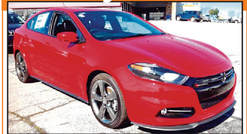
2016 Dodge Dart GT

Was - $26,265 Save - $4,265 $22,000* 6 spd., Auto, Nav., Stk#9105N