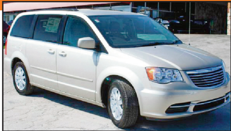
2016 Chrysler Town & Country LX

Was - $31,780 Save - $3,780 $28,000* Auto, 6 spd., Stk#9393N