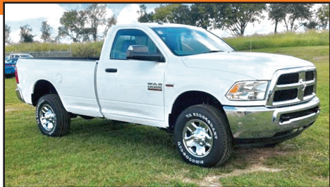
2015 Ram 3500 Tradesman

Was - $42,185 Save - $10,185 $32,000* 6 spd., Auto, 4x4, Stk#8845N