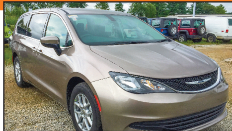
2017 Chrysler Pacifica LX

Was - $31,080 Save - $3,080 $28,000* Auto, 9 spd., V6, Stk#9701N