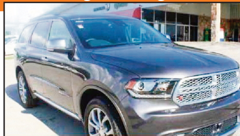
2016 Dodge Durango Citadel

Was - $51,760 Save - $4,760 $47,000* Auto, 8 spd., DVD Player, Stk#9685N