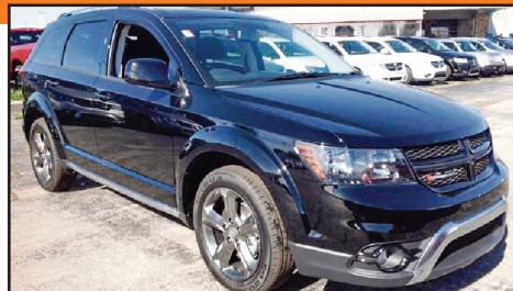
2016 Dodge Journey Crossroad

Was - $28,690 Save - $4,690 $24,000* Auto, 6 spd., Flex Fuel, Stk#9077N