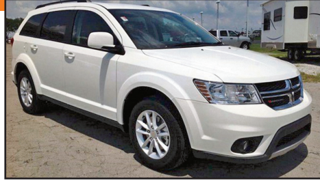
2015 Dodge Journey SXT

Was - $33,804 Save - $6,804 $27,000* 3.6L 6, Auto, FWD, Stk#8884N