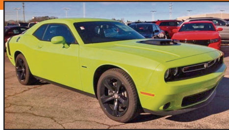
2015 Dodge Challenger R/T

Was - $40,975 Save - $6,975 $34,000* 8 spd., Auto, RWD, Shaker, Stk#8658N