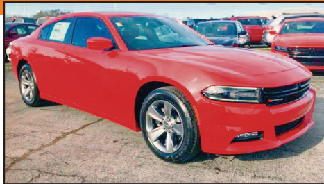
2016 Dodge Charger SXT

Was - $32,585 Save - $3,580 $29,000* Auto, 8 spd., V6, Stk#9358N