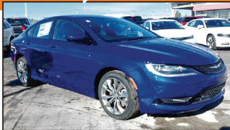
2016 Chrysler 200 S

Was - $28,680 Save - $2,680 $26,000* Auto, V6, 9 spd., Flex Fuel, Stk#9324N