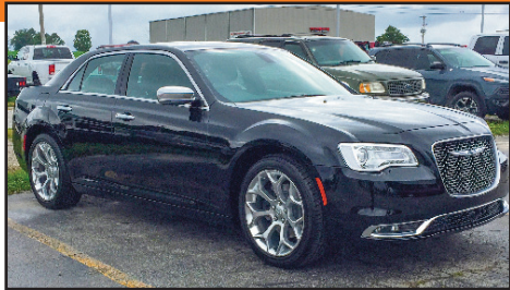
2015 Chrysler 300 C Platinum

Was - $43,390 Save - $8,390 $35,000* Stk#8749N