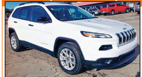
2016 Jeep Cherokee Sport

Was - $26,850 Save - $3,850 $23,000* Auto, 9 spd., Rear Cam., Stk#9327N