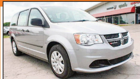
2016 Dodge Grand Caravan SE

Was - $23,780 Save - $3,780 $20,000* Auto, 6 spd., USB Port, Stk#9432N