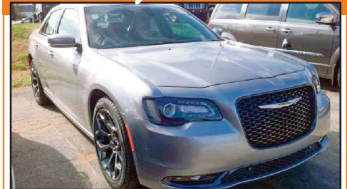
2016 Chrysler 300 S

Was - $39,760 Save - $4,760 $35,000* Auto, 8 spd., V6, Nav., Stk#9374N