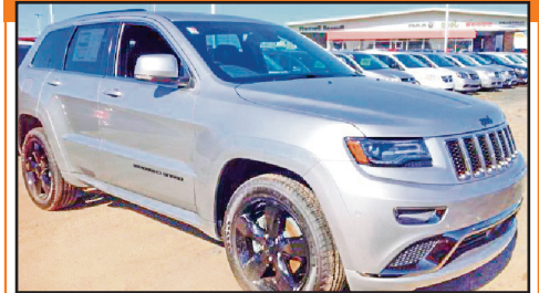
2015 Jeep Grand Cherokee Overland

Was - $50,670 Save - $6,670 $44,000* Auto, 8 spd., RearDVD, Stk#9148N