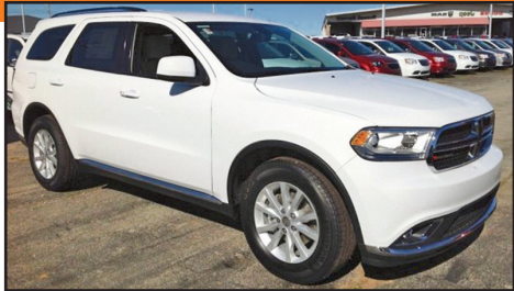
2015 Dodge Durango SXT

Was - $35,380 Save - $6,380 $29,000* 3.6L 6, 8 spd., Auto, Stk#9118N