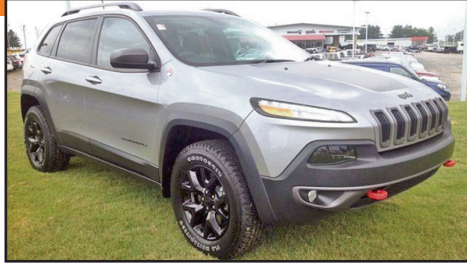
2015 Jeep Cherokee Trailhawk

Was - $32,579 Save - $5,579 $27,000* 9 spd., Auto, 4x4, Stk#8965N