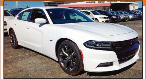
2015 Dodge Charger R/T

Was - $41,080 Save - $7,080 $34,000* Nav., Back-Up Cam., Auto, Stk#9019N