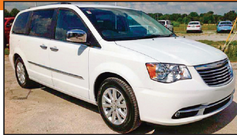
2015 Chrysler Town & Country Limited

Was - $41,160 Save - $7,160 $34,000* Platinum, 6 spd., Auto, Stk#8942N