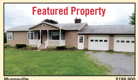
Deceiving Ranch, fully finished walk-out basement, 4BB custom woodwork throughout, large addition on back master suite. Jennie M. Chapin 761-5058 (C)