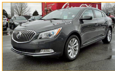
2016 Buick Lacrosse Stk#BR36

MSRP: $31,010 HB Discount: - $2,287 GM Rebate: - $500 Buick Conquest: - $1,000 Bonus Cash: - $750 No Haggle Price $26,473*