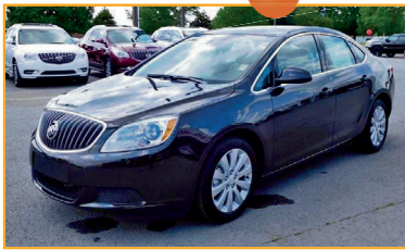
2016 Buick Verano Stk# BR63

MSRP: $24,875 HB Discount: - $1,635 GM Rebate: - $500 Conquest Rebate: - $1,000 Bonus Cash: - $750 Select Model Cash: - $1,000 No Haggle Price $19,990*