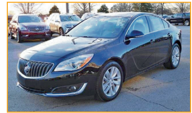
2016 Buick Regal Stk# BR52

MSRP: $31,100 HB Discount: - $1,851 GM Rebate: - $1,000 Bonus Cash: - $2,000 Select Model: - $2,000 No Haggle Price $24,249*