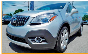
2016 Buick Encore Stk#BR81

MSRP: $24,875 HB Discount: - $1,635 GM Rebate: - $500 Conquest Rebate: - $1,000 Bonus Cash: - $750 Select Model Cash: - $1,000 No Haggle Price $19,990*