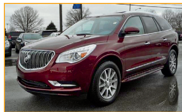
2016 Buick Enclave Stk#BR34

MSRP: $35,225 HB Discount: - $1,862 GM Rebate: - $7,045 No Haggle Price $26,318*