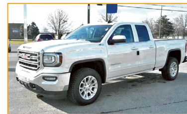
2016 GMC Sierra 4WD, DC, Stk#TR28

MSRP: $41,745 HB Discount: - $2,979 GM Rebate: - $750 Bonus Cash: - $750 Conquest: - $1,000 No Haggle Price $36,266*