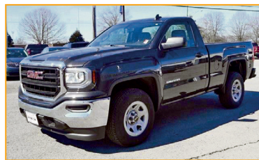
2016 GMC Sierra Reg. Cab, Stk#TR43

MSRP: $27,735 HB Discount: - $2,173 GM Rebate: - $750 Buick Conquest: - $1,000 Buick Bonus Cash: - $500 Bonus Cash: - $750 No Haggle Price $22,622*