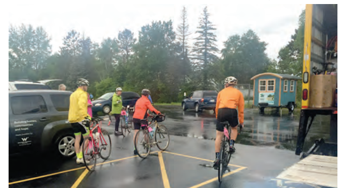
Cyclists leave McGregor school for a 72-mile ride to Grand Rapids in the pouring rain.