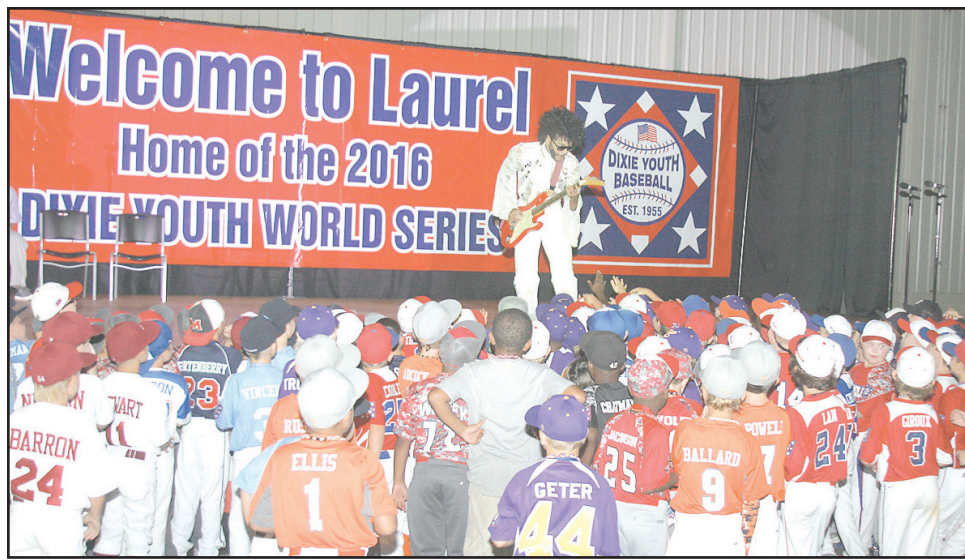
The young players from all over the Southeast Louisiana stormed the stage to get closer to Prince.