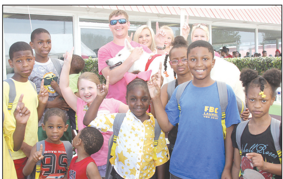
Kids pose for a photo with Raising Cane's Wolfe Dog