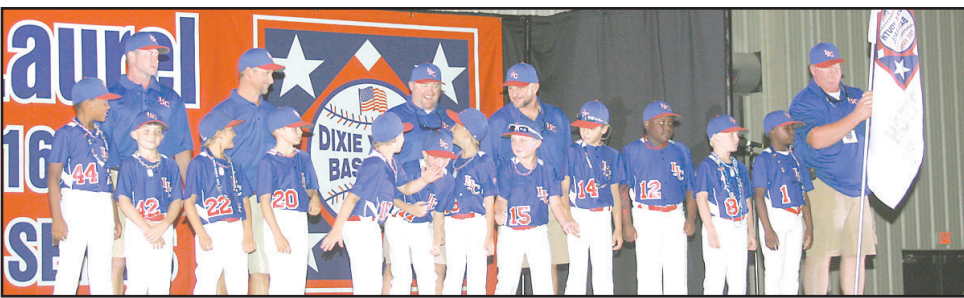
Laurel Jones County Machine Pitch Host Team.