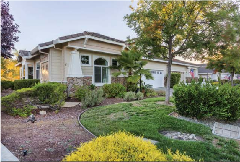
EVERGREEN VALLEY $849,000

2064 Folle Blanche Drive | 2bd/2ba Vicki Harris | 408.754.1500 SALE PENDING