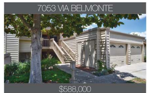
7053 VIA BELMONTE