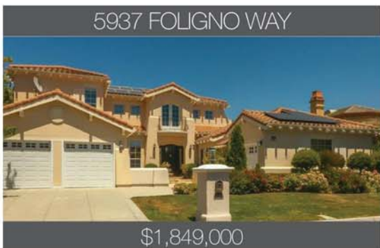
5937 FOLIGNO WAY