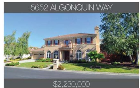
5652 ALGONQUIN WAY