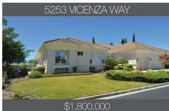
5253 VICENZA WAY