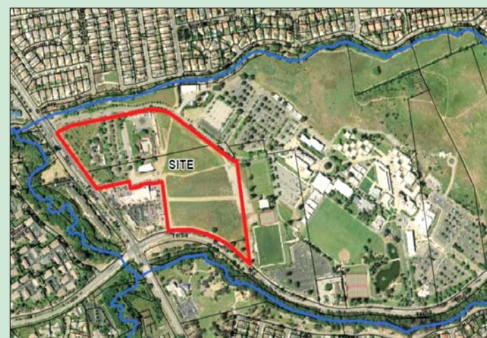
A community meeting will focus on the rezoning of 27-acres of Evergreen College 'surplus' land, shown in the map above.