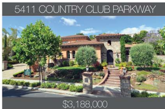
5411 COUNTRY CLUB PARKWAY