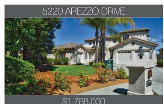
5220 AREZZO DRIVE