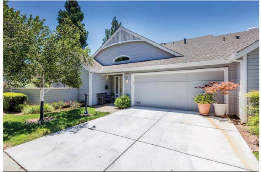
EVERGREEN VALLEY $749,000

2064 Folle Blanche Drive | 2bd/2ba Vicki Harris | 408.754.1500 SALE PENDING