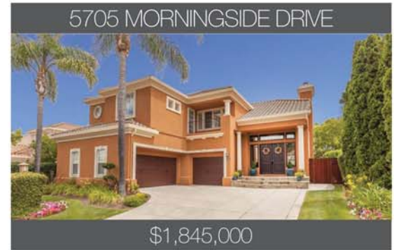
5705 MORNINGSIDE DRIVE