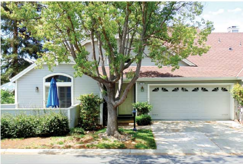
EVERGREEN VALLEY $729,000

7849 Prestwick Circle | 2bd/2ba David Harris | 408.754.1500 SALE PENDING