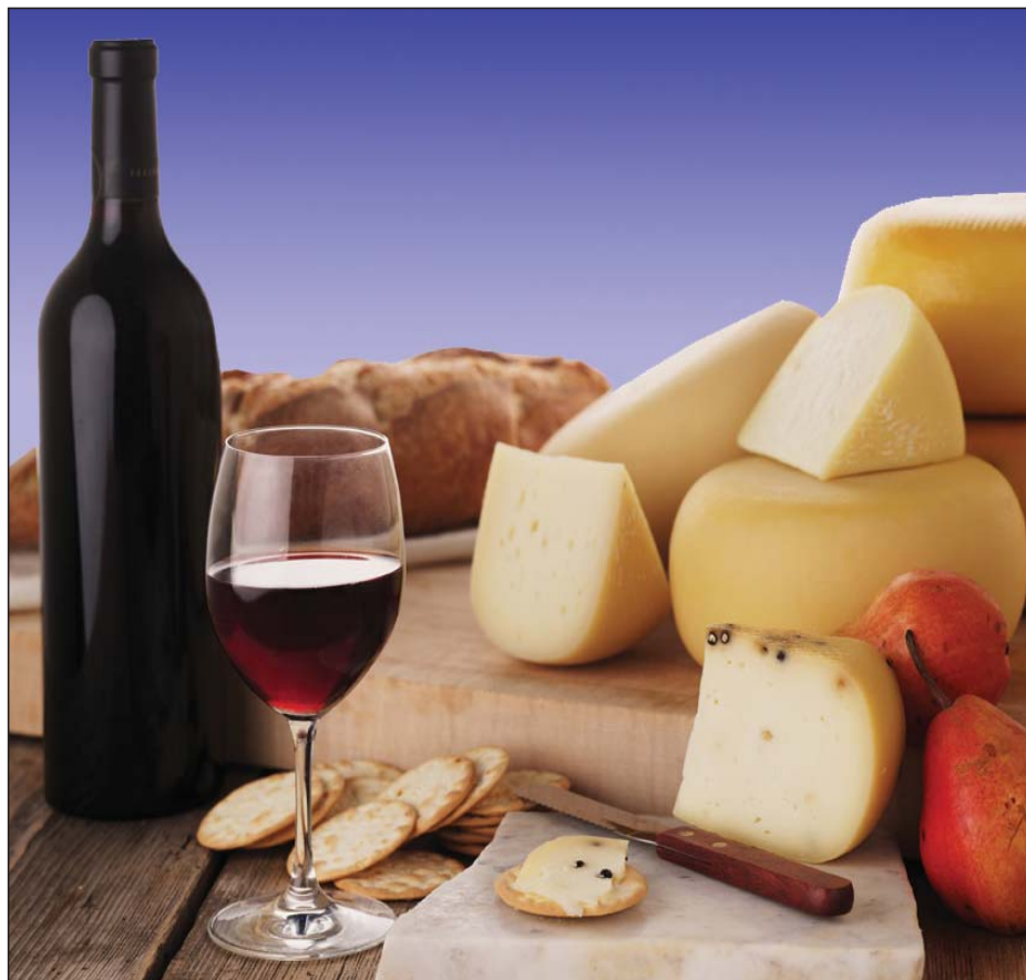
Wine and cheese tastings are a popular event at New Seasons Market.