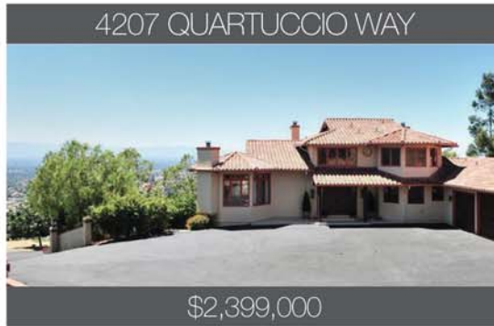
4207 QUARTUCCIO WAY