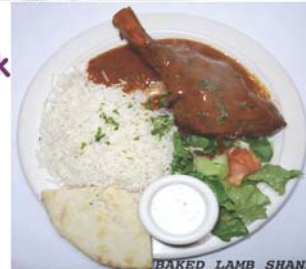
BAKED LAMB SHANK

Kebobs Baked Lamb Shank Sicilian Lasagna Moussaka Butter Chicken Gyros & Falafel & Many More