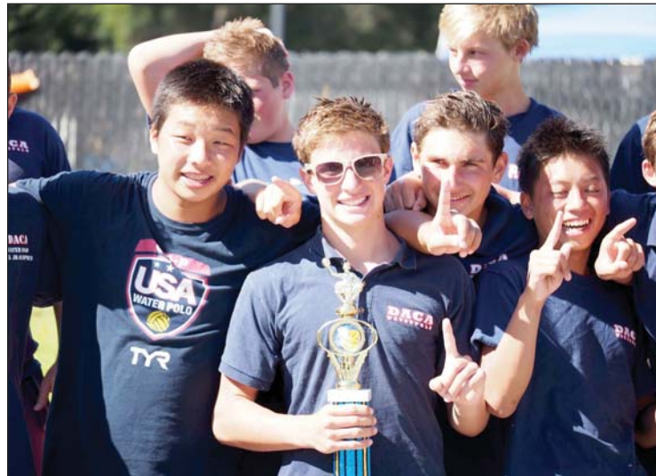
Several local athletes are competing in the USA Water Polo Junior Olympics Tournament, which is being based in San Jose this year.