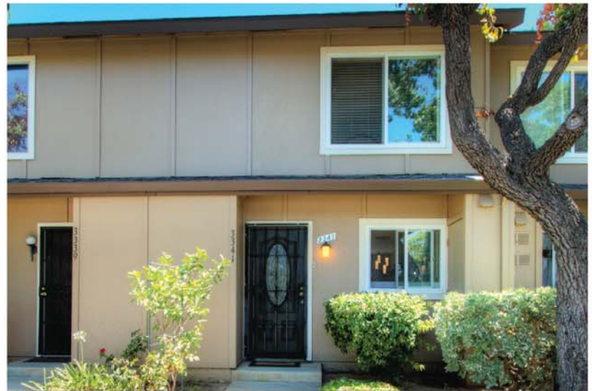
EVERGREEN VALLEY $479,000

7781 Beltane Drive | 2bd/2ba Vicki Harris | 408.754.1500 SALE PENDING