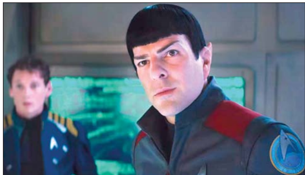
Left stranded in a rugged wilderness, Kirk, Spock (Zachary Quinto) and the rest of the crew must race to find an escape.