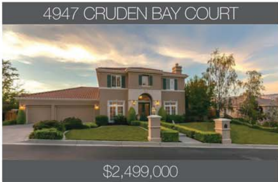
4947 CRUDEN BAY COURT