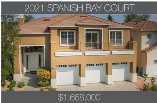
2021 SPANISH BAY COURT