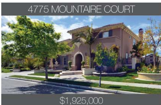
4775 MOUNTAIRE COURT