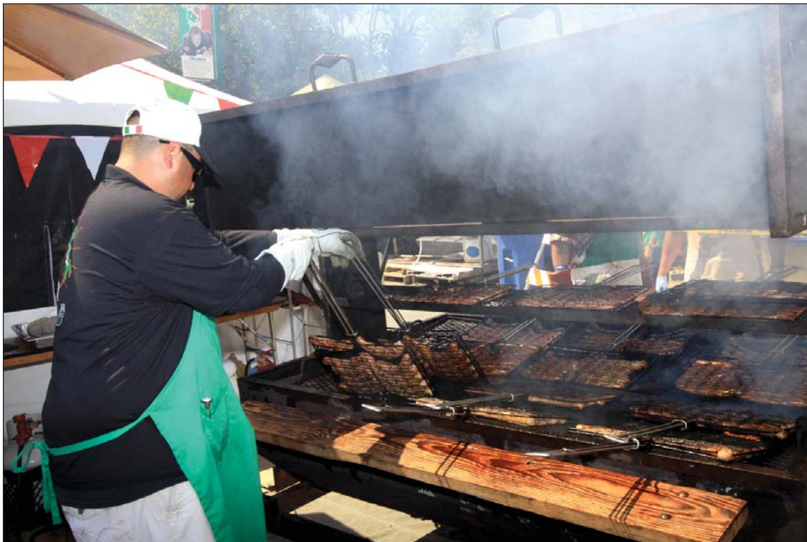
Amazing barbecue (above) and wine tasting (above right) is always a very tasty part of the Italian Family Festa.