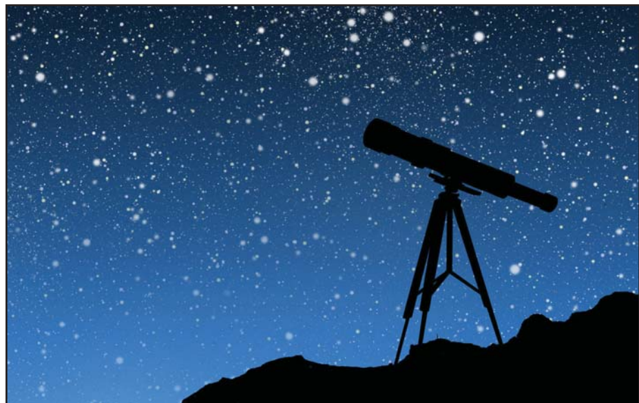
Enjoy a free public stargazing session after the talk at the Montgomery Hill Observatory of EVC.