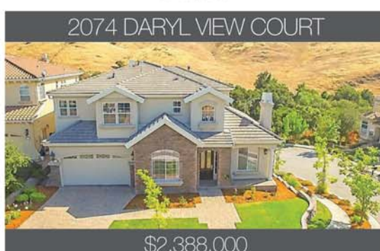
2074 DARYL VIEW COURT