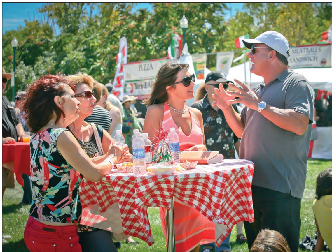
Food, friends and fun conversation are hallmarks of the Italian Family Festa.