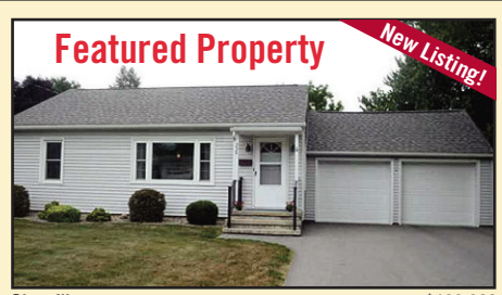
$129,900 Stop the car, Sherrill Ranch adorable cream puff, vinyl siding vinyl windows, new kitchen the list across vinyl windows, new kitchen the list goes on. Jennie M. Chapin 761-5058 (C)