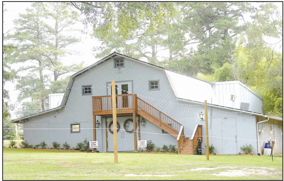
The old horse barn is now The Cajun Kitchen and Hitchin' Post wedding reception area.

For more information and to see the weekly menu visit their website at www.thehitchinposte.com or Facebook page The Hitchin Poste, or call 601-335-8280.