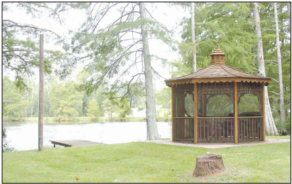
Gazebo near the 5.5 acre pond