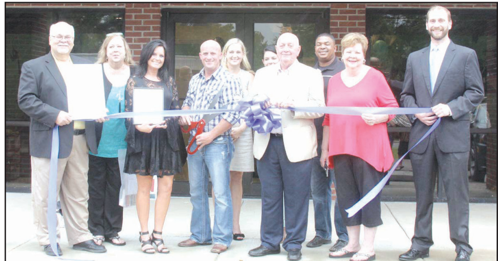
Ribbon cutting held for the Touch of Grace in Ellisville