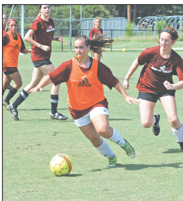
Campers compete during the JCJC Girls Team Soccer Camp last month at Bobcat Soccer Field.

There was also a mix of American and international coaches from different clubs, NAIA and NCAA colleges on hand for the camp.