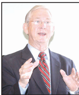
Judge Charles Pickering

In speaking of race relations Pickering stated, "We still have a ways to go to improve race relations. We come to the table