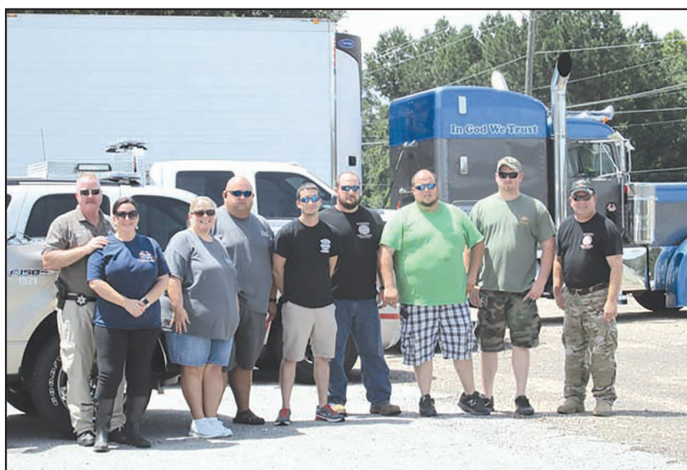
With all the trucks loaded, the volunteers are ready to head south.

Louisiana, we stand with you. You are not alone.