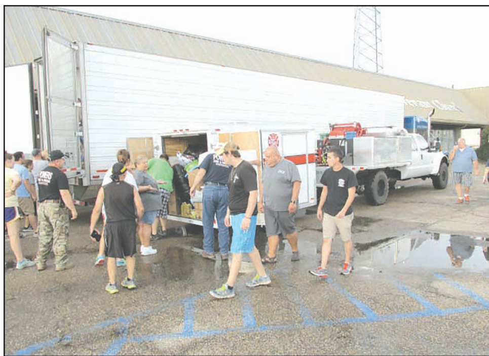
Unloading supplies at a distribution center in Louisiana.