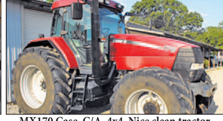
MX170 Case, C/A, 4x4, Nice clean tractor, 7,779 hrs. $29,500