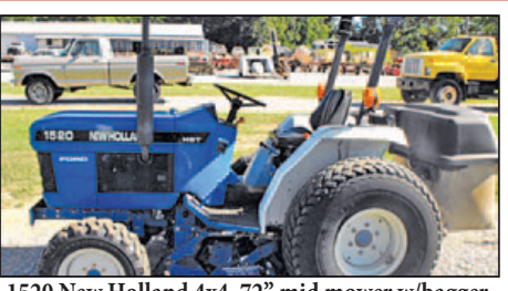
1520 New Holland 4x4, 72" mid mower w/bagger, power steering, canopy, Super NICE! $9,500