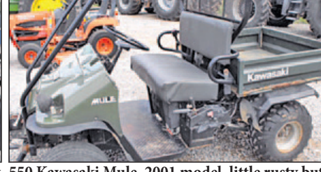
550 Kawasaki Mule, 2001 model, little rusty but runs and drives good $2,450