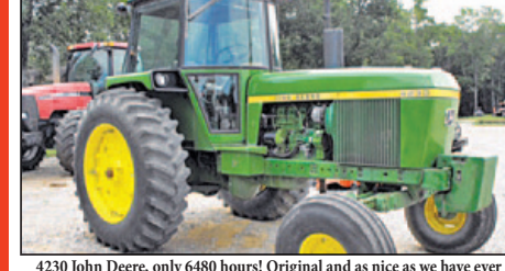
4230 John Deere, only 6480 hours! Original and as nice as we have ever seen, installing complete new a/c (134) great matching tires all around, front weights, single remote, quad range trans., a must see tractor! $21,500