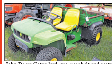
John Deere Gator 2wd, gas, new belt and seats, runs and drives good. 2,021 hrs. $2,950