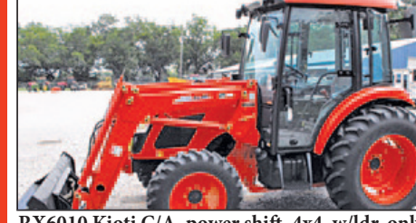
RX6010 Kioti C/A, power shift, 4x4, w/lldr. only 158 hrs. Like new! $27,800