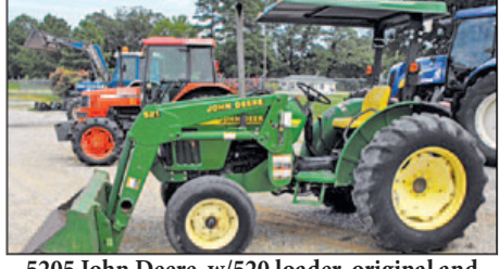
5205 John Deere, w/520 loader, original and nice, only 1,200 hrs. $13,900