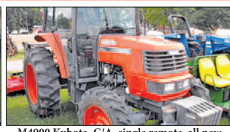
M4900 Kubota, C/A, single remote, all new tires $18,900