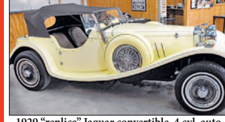
1929 "replica" Jaguar convertible, 4 cyl, auto, Nice toy, fun to drive $7,950