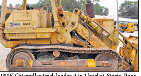
955K Caterpillar track loader, 4 in 1 bucket, Starts, Runs, Works great, very solid machine, 80% bottom $15,000