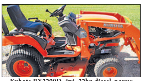
Kubota BX2200D, 4x4, 22hp diesel, power steering, loader, 60" mid mower $7,850