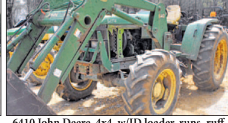
6410 John Deere, 4x4, w/JD loader, runs, ruff and needs repairs, AS-IS $12,000