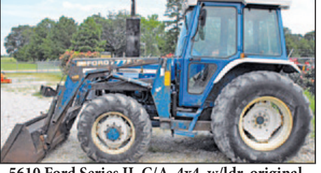
5610 Ford Series II, C/A, 4x4, w/lldr. original, 4,400 hrs. $18,900