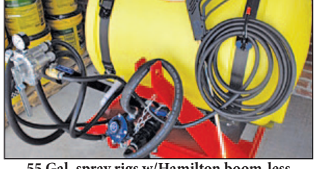
55 Gal. spray rigs w/Hamilton boom-less nozzle and hand wand. NEW $695.00

COMING SOON: LS185B New Holland Skid Steer, C/A, 1,037 hrs. Sharp. 751 Bob Cat 2,712 hrs. 2750 John Deere C/A, New Interior, Excellent Mechanically.