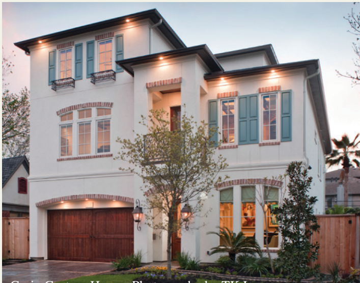
Croix Custom Homes